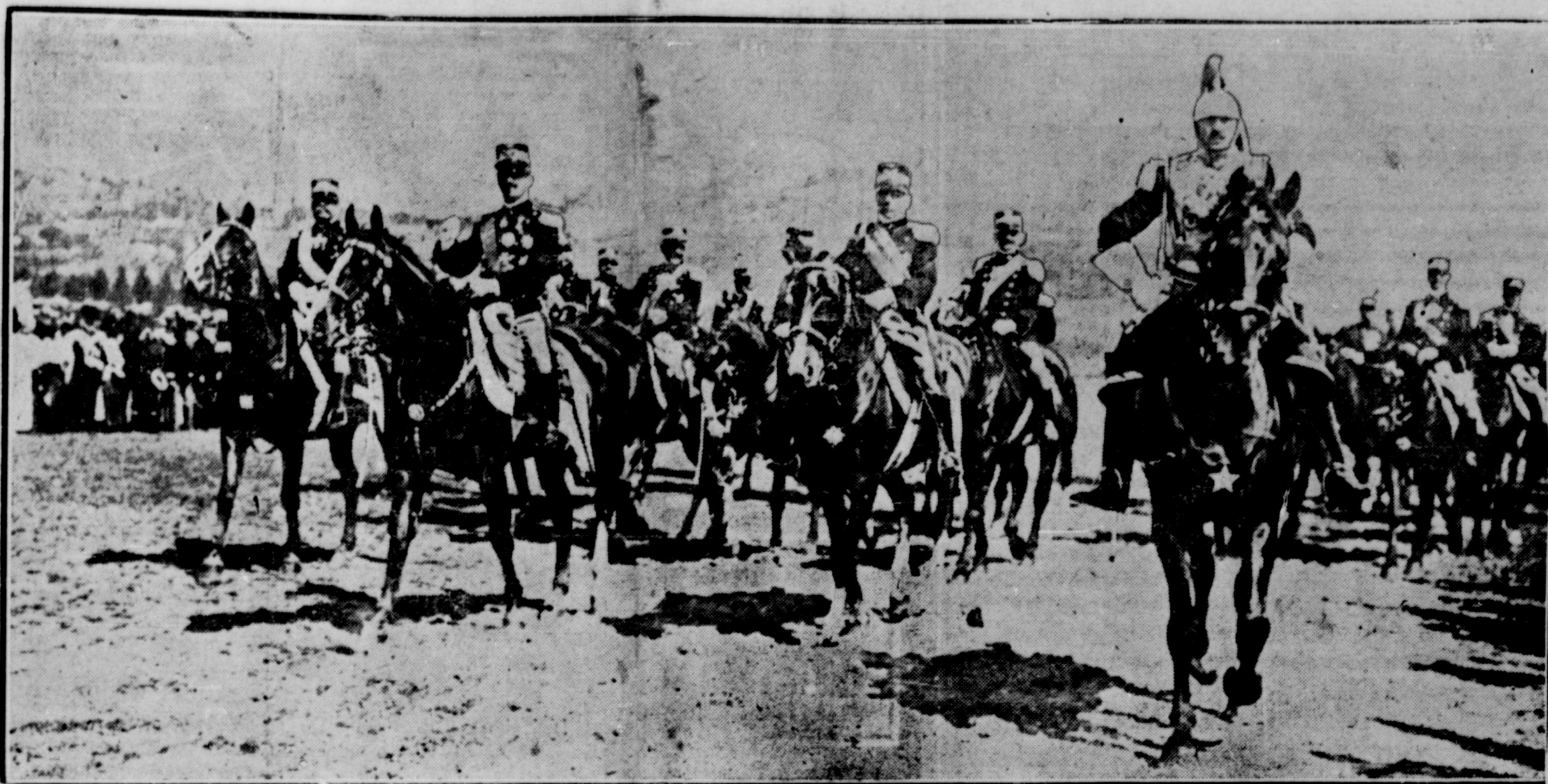
KING VICTOR EMMANUEL OF ITALY AT THE HEAD OF HIS REGIMENT

Third Avenue East Phone 118 We Use the Most Modern Laundry Machinery Built. Come In Any Tuesday or Wednesday and See How We Do It. Absolute Satisfaction is Guaranteed.