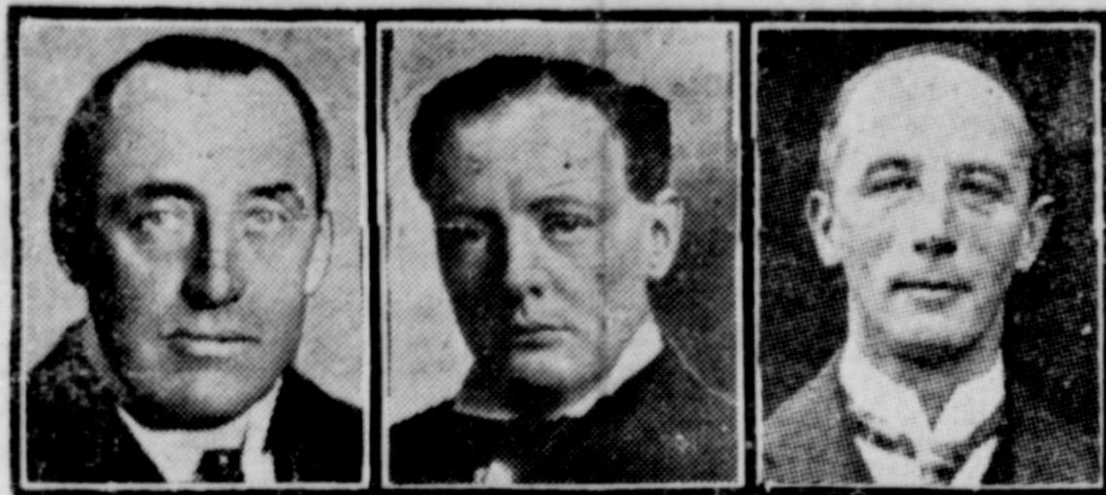
SIR EDWARD CARSON • WINSTON CHURCHILL • SIR S. BUCKMASTER

UNEXPECTED CHANGES IN COALITION CABINET —Sir John Simon is now Home Secretary. As Former Attorney General he was probably offered the High Chancellorship. Walter Long is president of the Local Government Board; he replaces Samuel, whose exclusion is a great surprise. Reginald McKenna gets next in importance to the Premiership. Sir Edward Carson, as Attorney General, gets the office with the most money in it. Winston Churchill's removal from the Admiralty was fore-casted, but that he should be deliberately shelved to the Chancellorship of the Duchy of Lancaster was unexpected. Sir S. Buckmaster gets the Lord High Chancellorship, the highest legal office in the Empire.