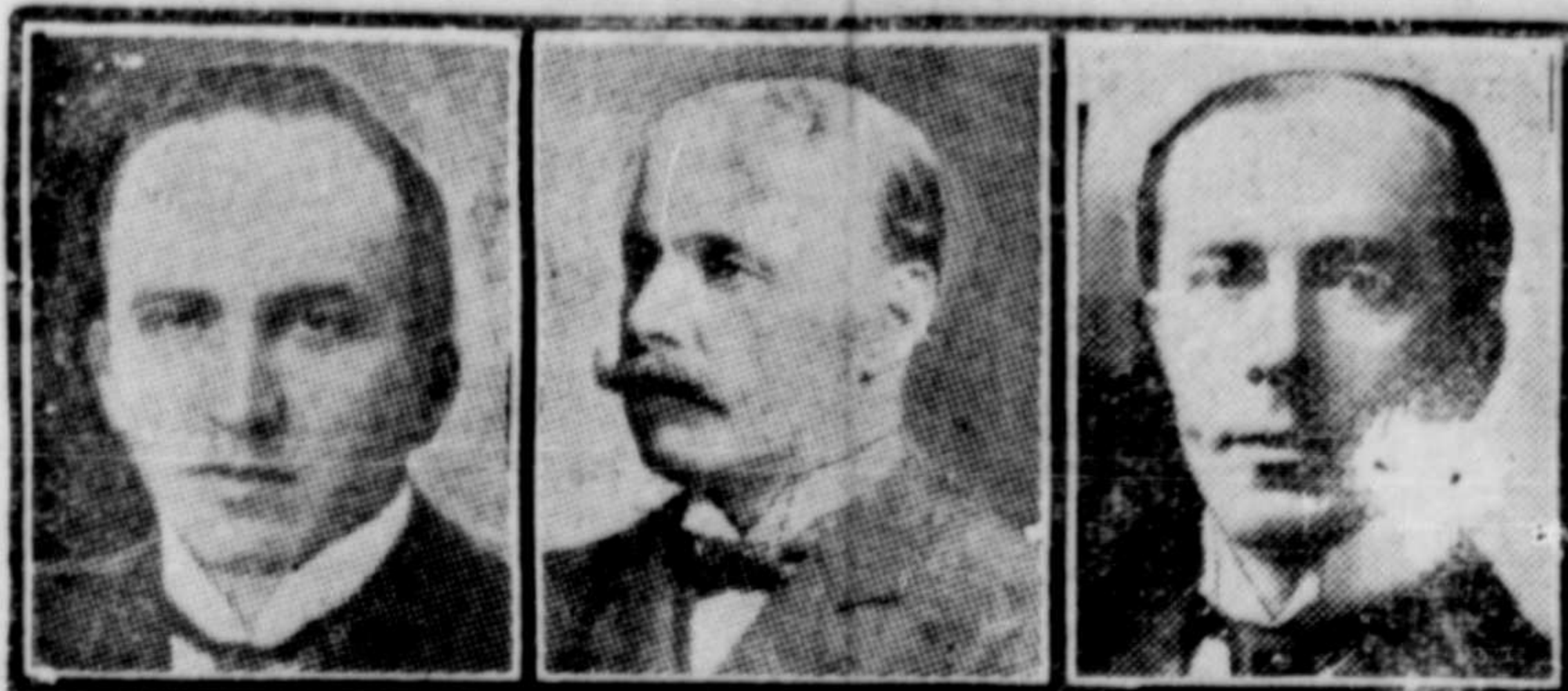
SIR JOHN SIMON • WALTER LONG • REGINALD MCKENNA