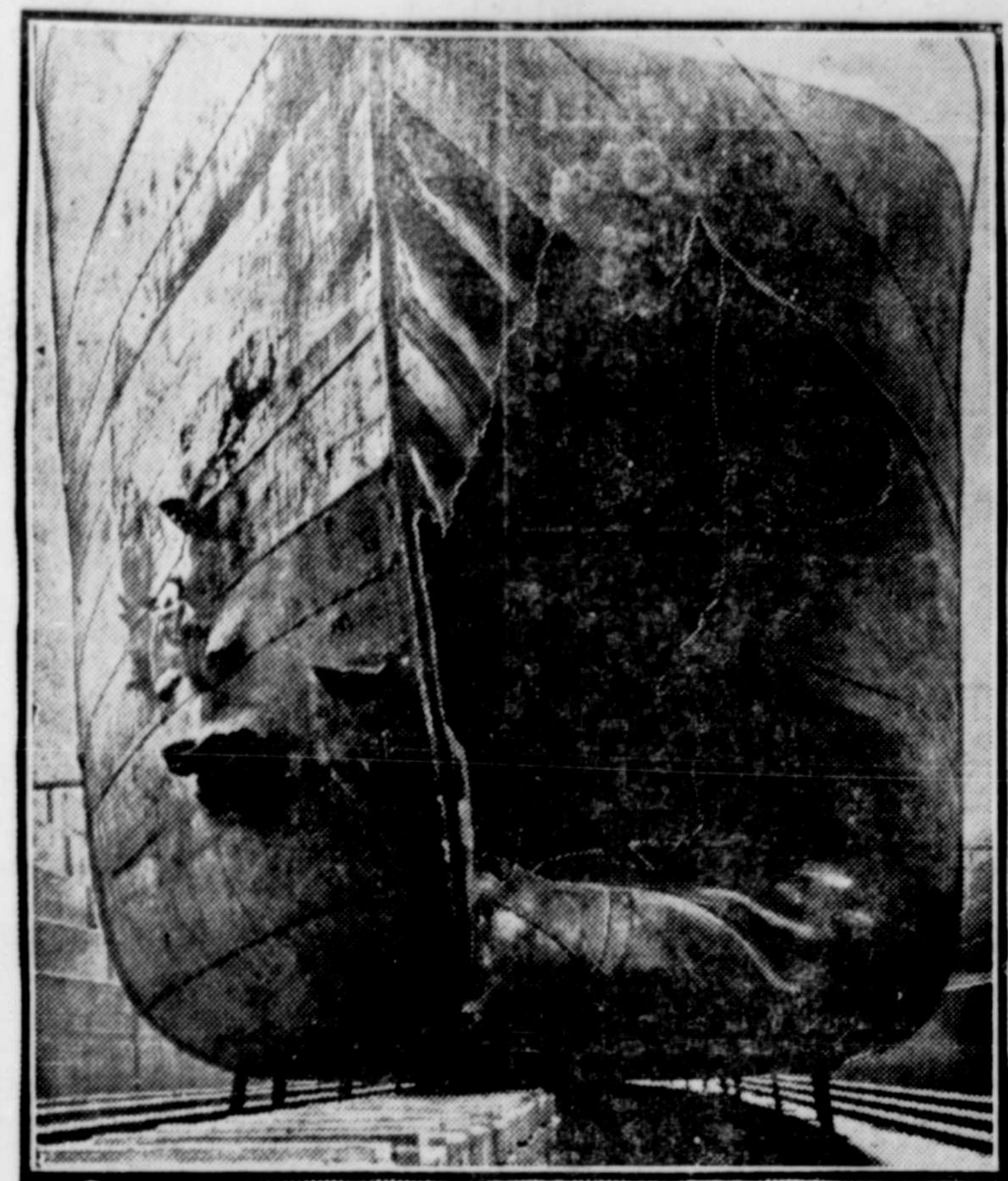
OBJECT OF GERMAN TORPEDO. —The Norwegian oil tank steamer Belridge was torpedoed by a German submarine. The explosion occurred well forward, enabling the ship to keep afloat.

was the chief feature of yesterday's operations. French Advancing. London, June 19.—The French are holding the Germans at Arras, and have gained on the sides of Souchez and are still advancing. London, June 19.—The steamer Dulcie, of 2,000 tons, has been torpedoed off Suffolk. One man was drowned.