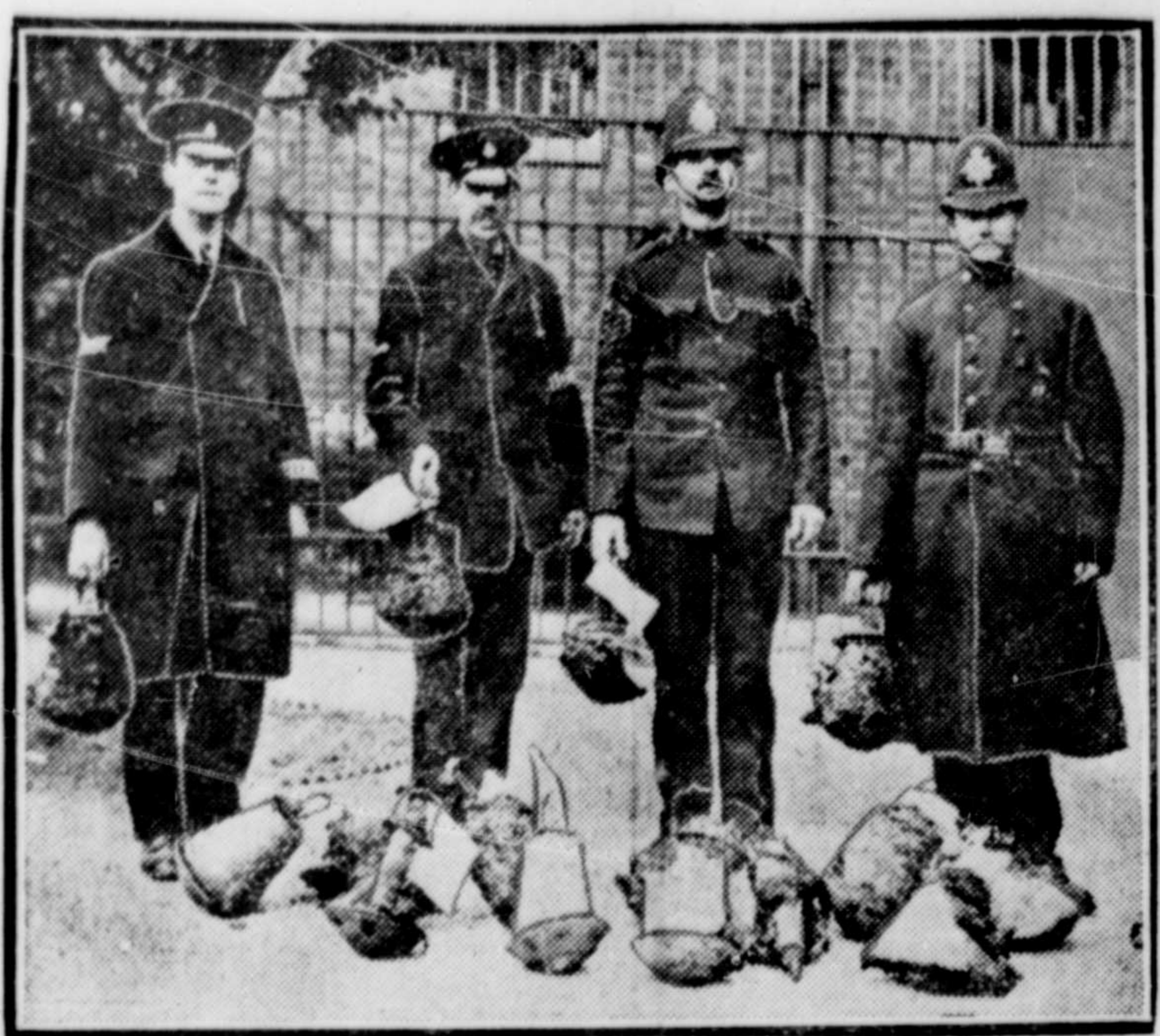
DROPPED BY THE BABY KILLERS AT SOUTHEND, ENGLAND—Police at the fashionable English resort, with some of the bomb souvenirs left by the Zeppelin raiders recently.