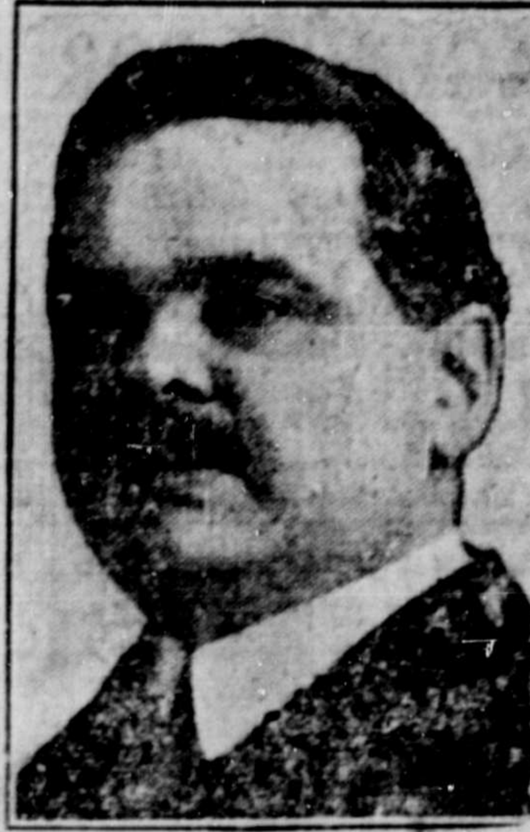
SIR LOMER GOUIN

Who has just resigned the premiership of the province of Quebec.