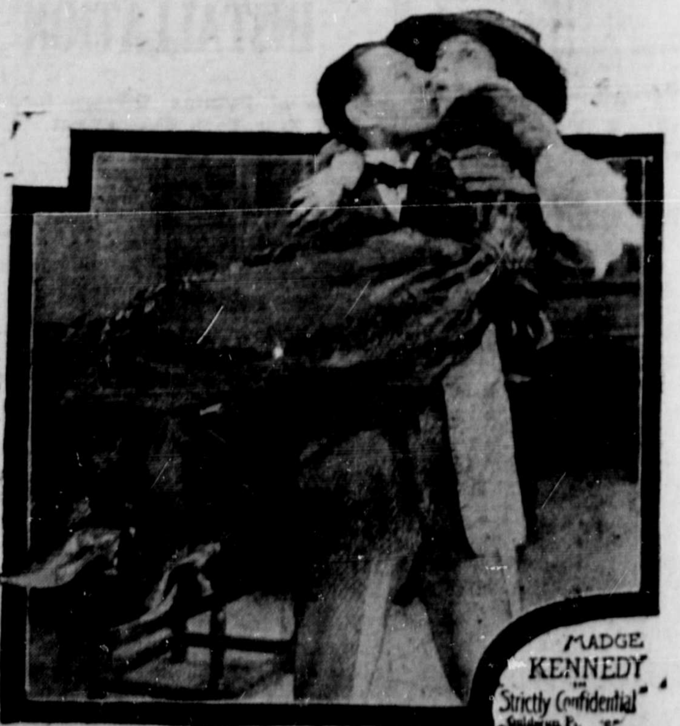
Starring tonight at the Westholme Theatre.

"Colonel He's a Liar's Waterloo" Pictorial