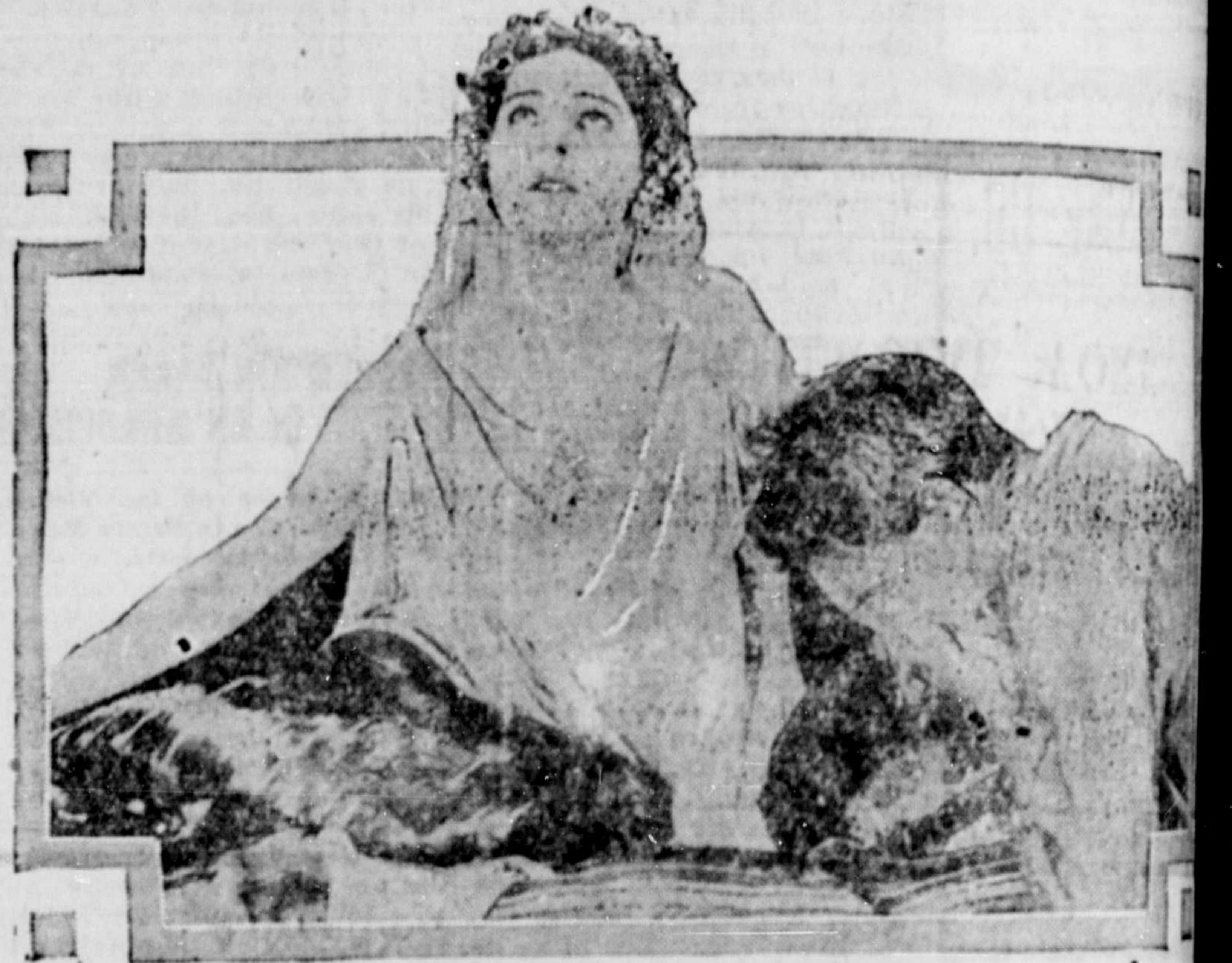
NAZIMOVA IN "STRONGER THAN DEATH"