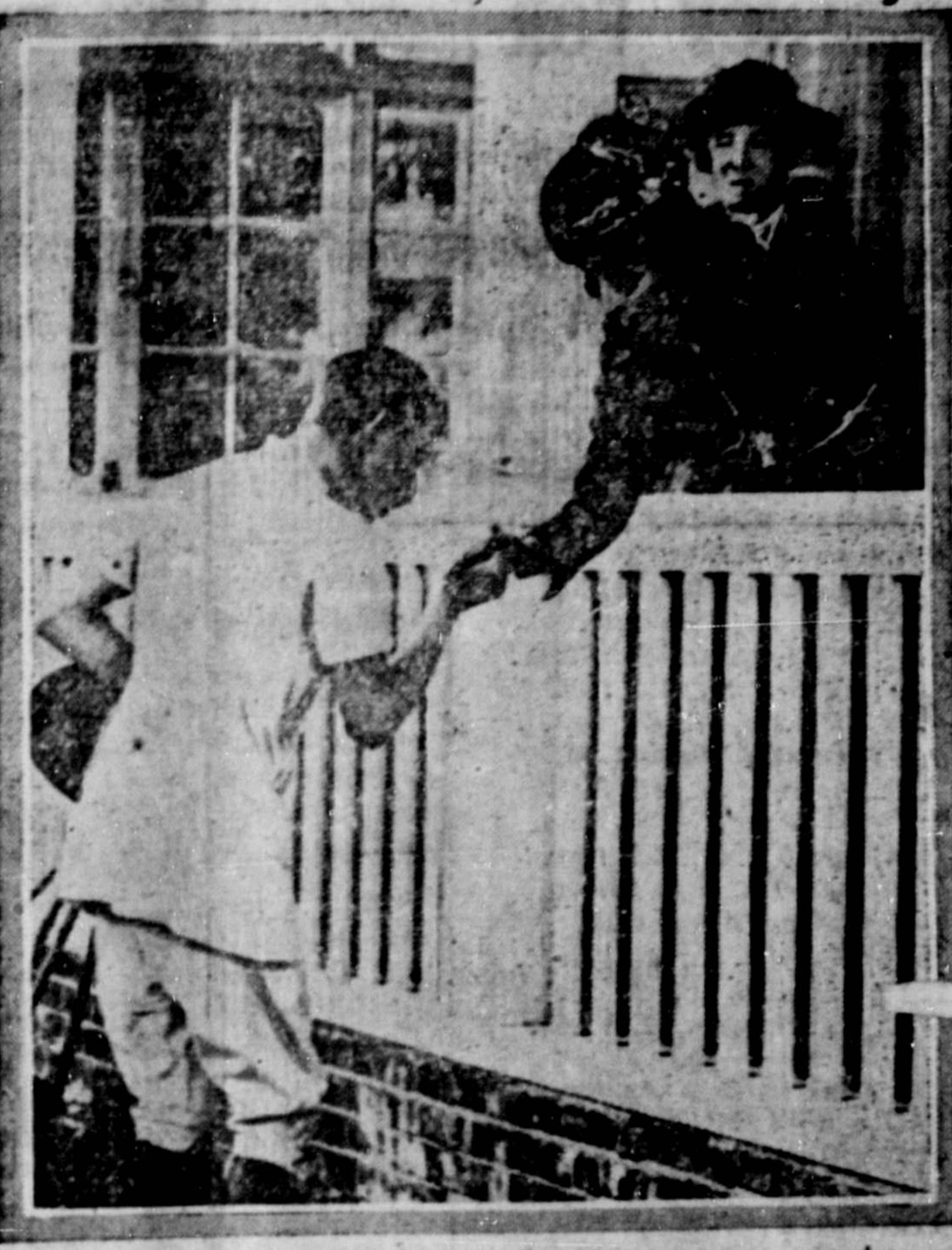
The camera caught this scene of royalty when King Alfonso paid his respects to the British Queen Mother just after his polo team had beaten an English team in a match at Roehampton.