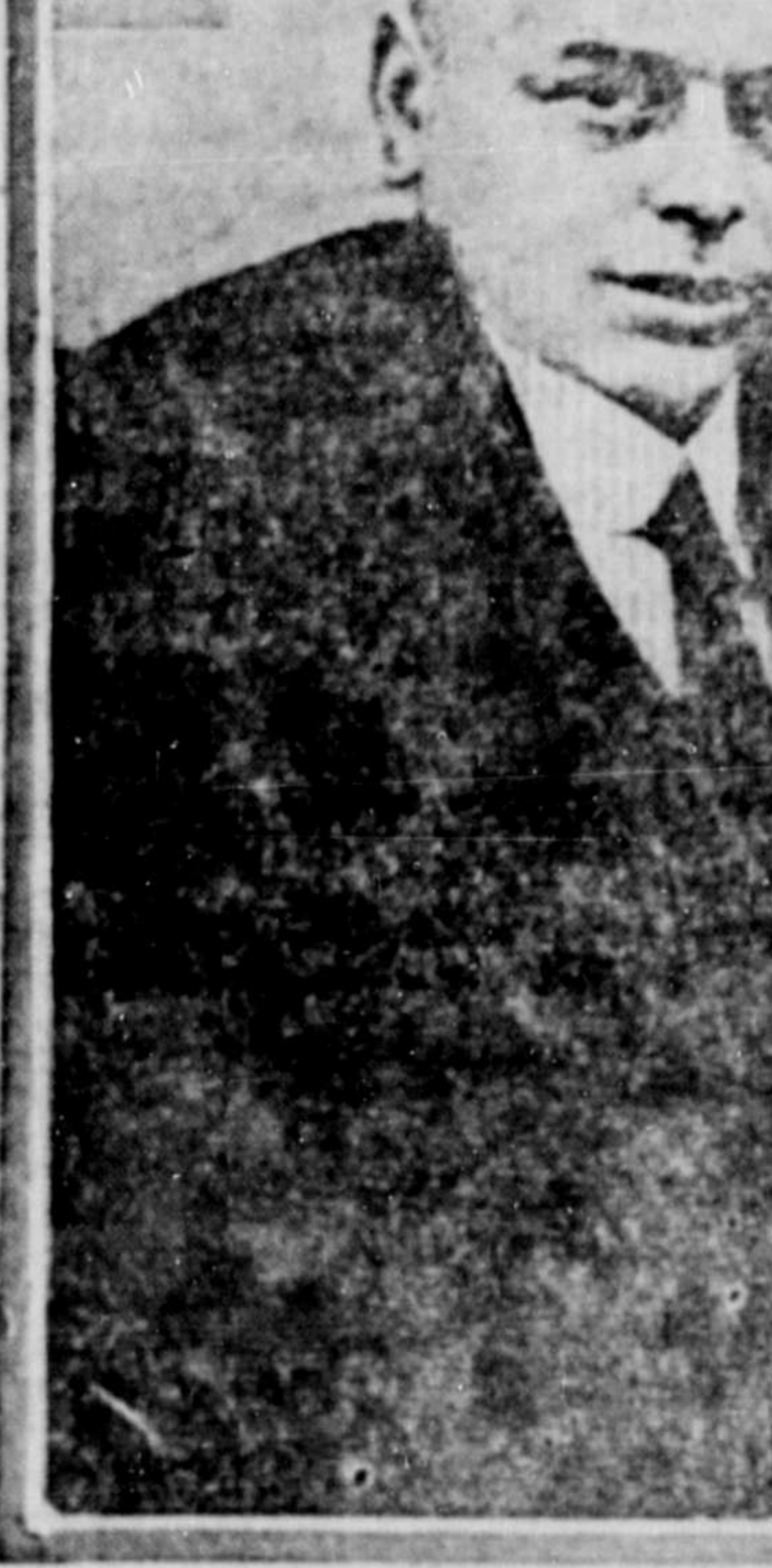
Bela Kun, formerly Hungarian dictator, has been interned in a camp at Passau, Germany. The Berlin government has not replied to Hungary's demand for his extradition. A group of Independent Socialists staged a demonstration in the Lustgarten against the surrender of him.