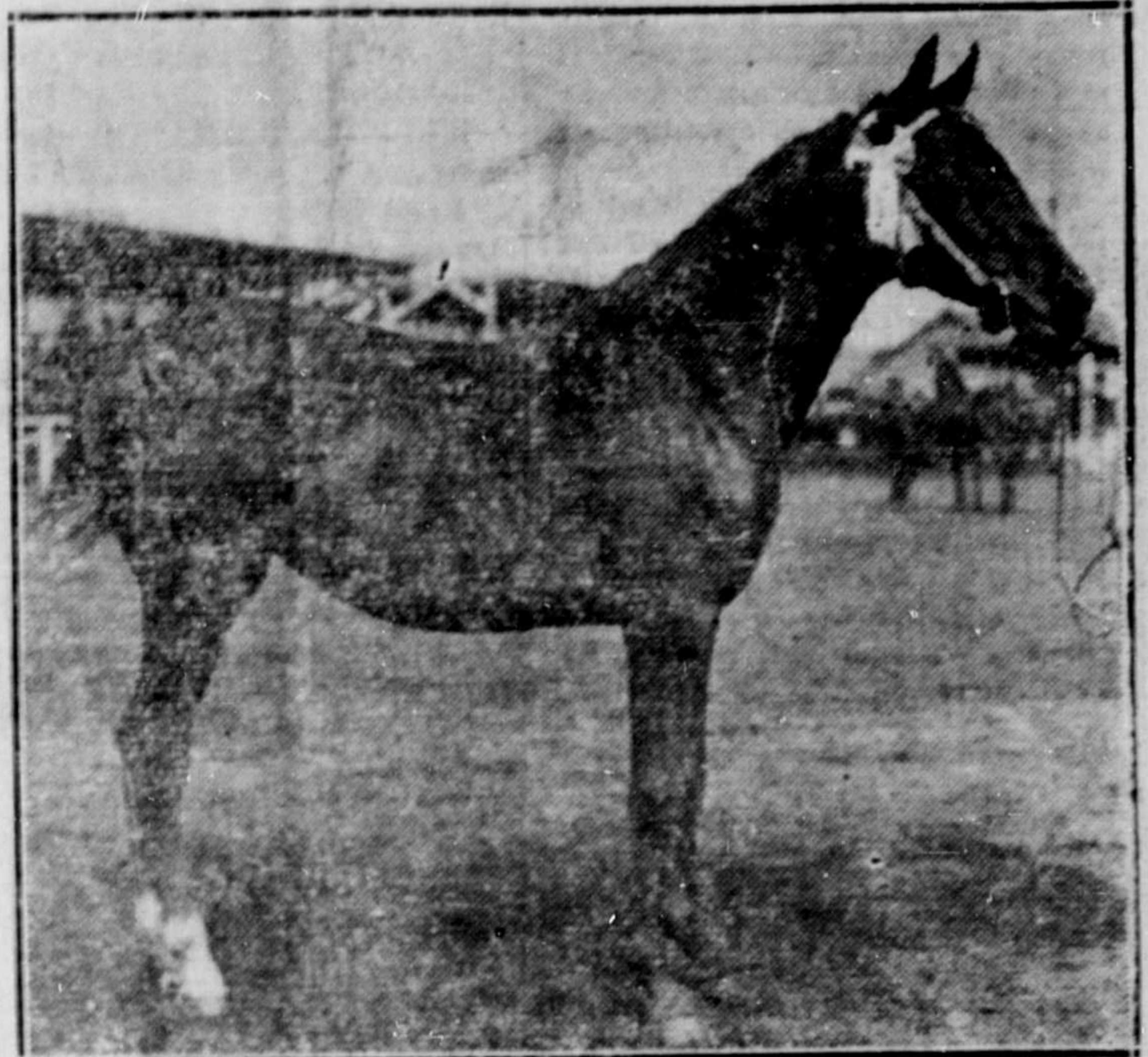
"Stella," who won the roadster class at the Toronto exhibition this year. She is owned by a Milton, Ont., enthusiast who also won the American Sweepstakes with her.