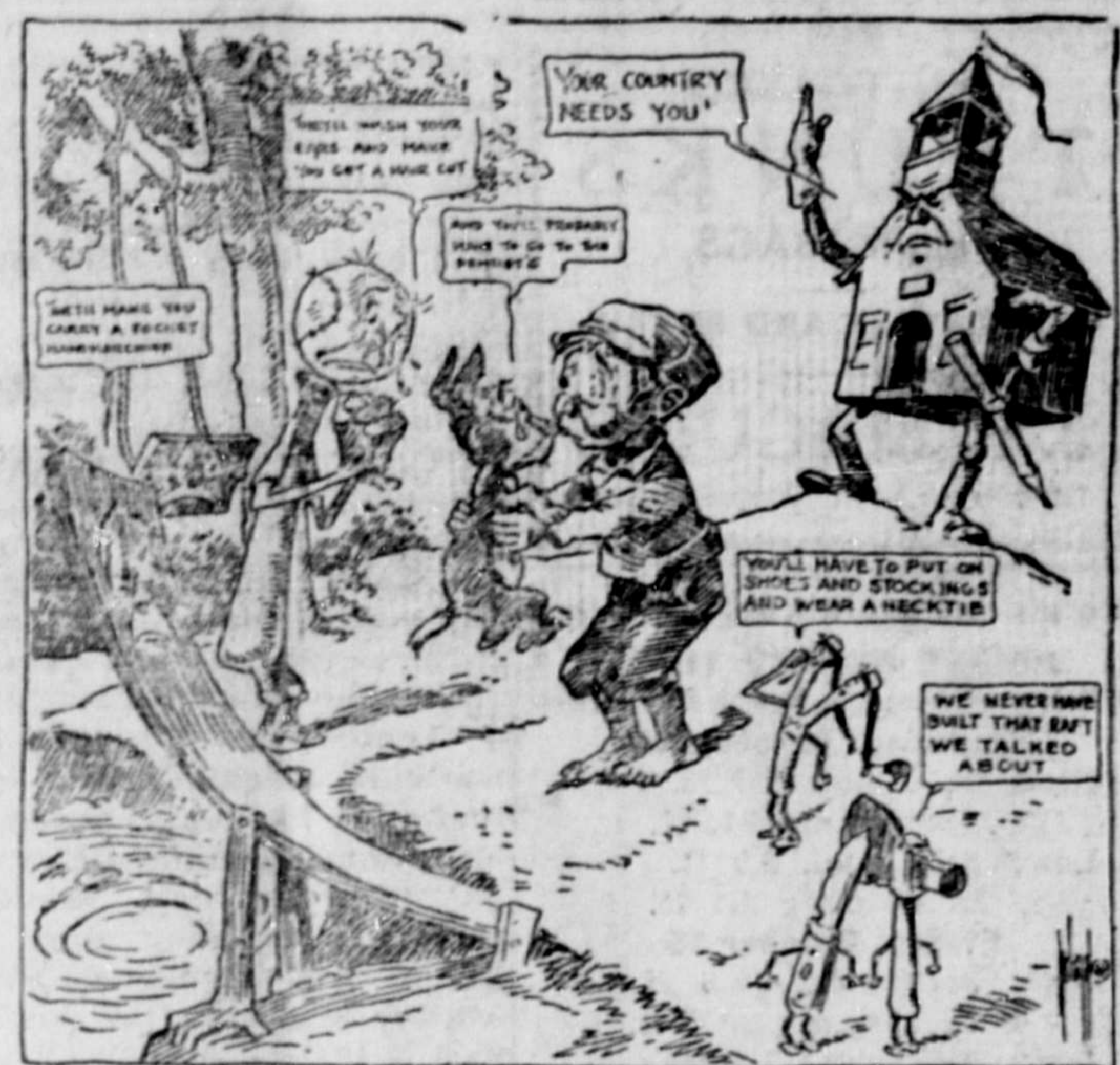
"CALLED TO THE COLORS."—Inland in Columbus Dispatch.