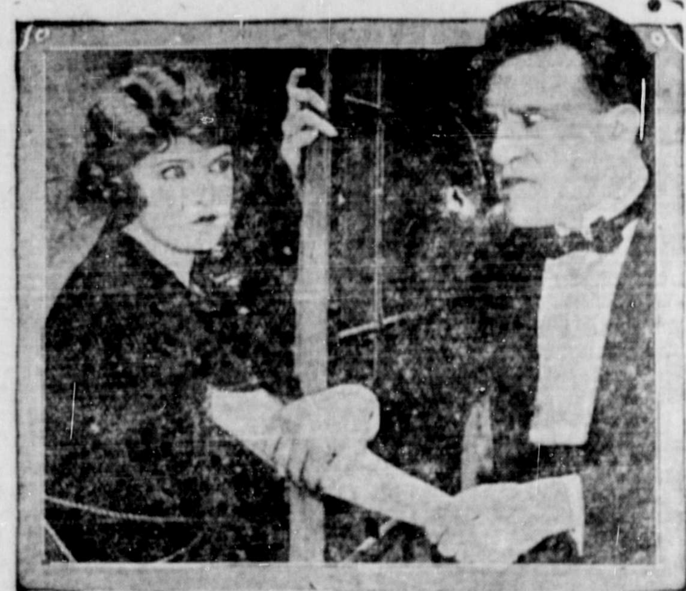
MAY ALLISON in "HELD IN TRUST"