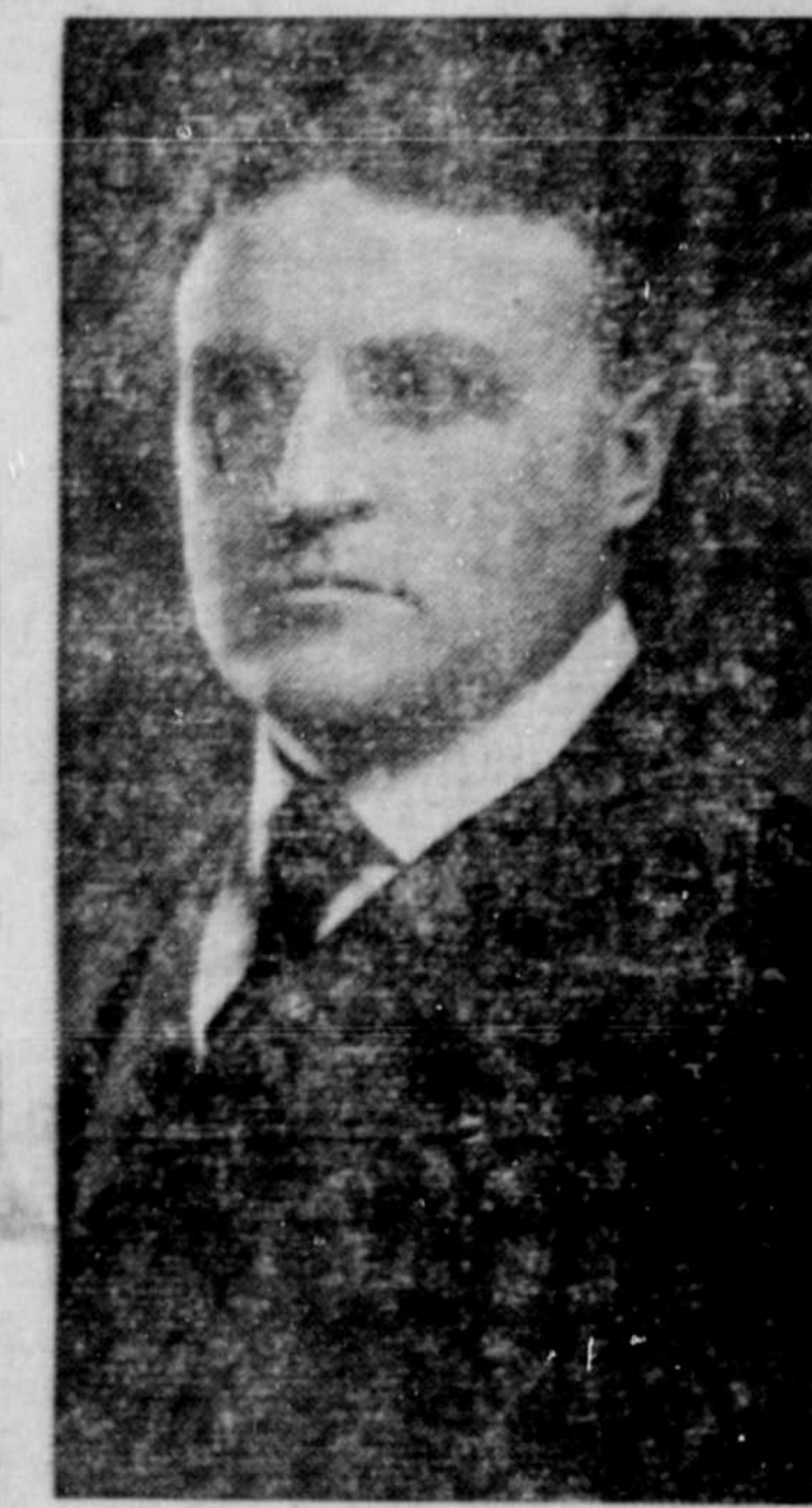
MINISTER OF LANDS.

Hon. T. D. Pattullo, not a knocker but a man who does things, is expected to be returned with a large majority on Wednesday.