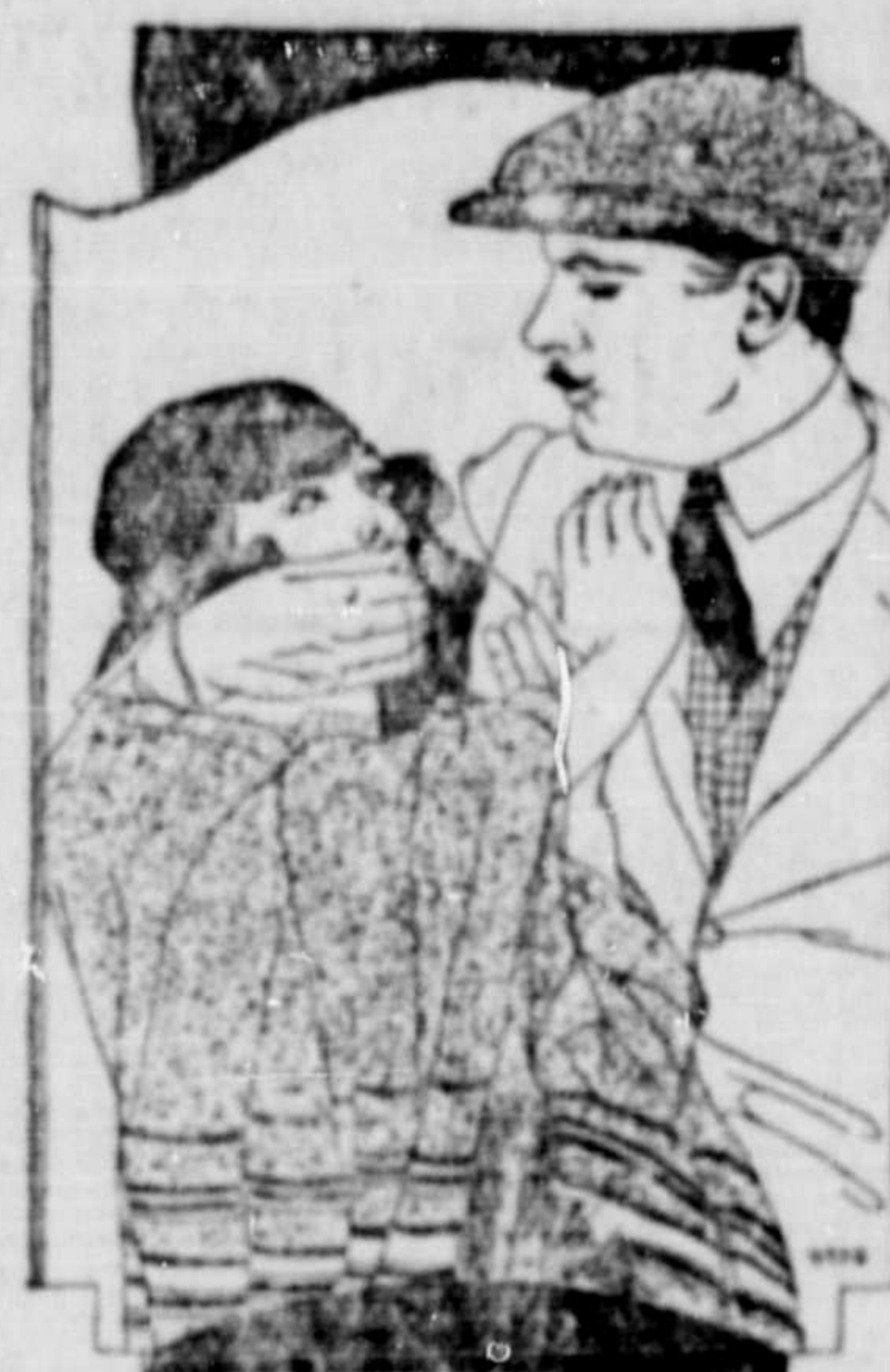
MAURICE TOURNEUR presents "The Life Line" A Dramatic Artistic Production