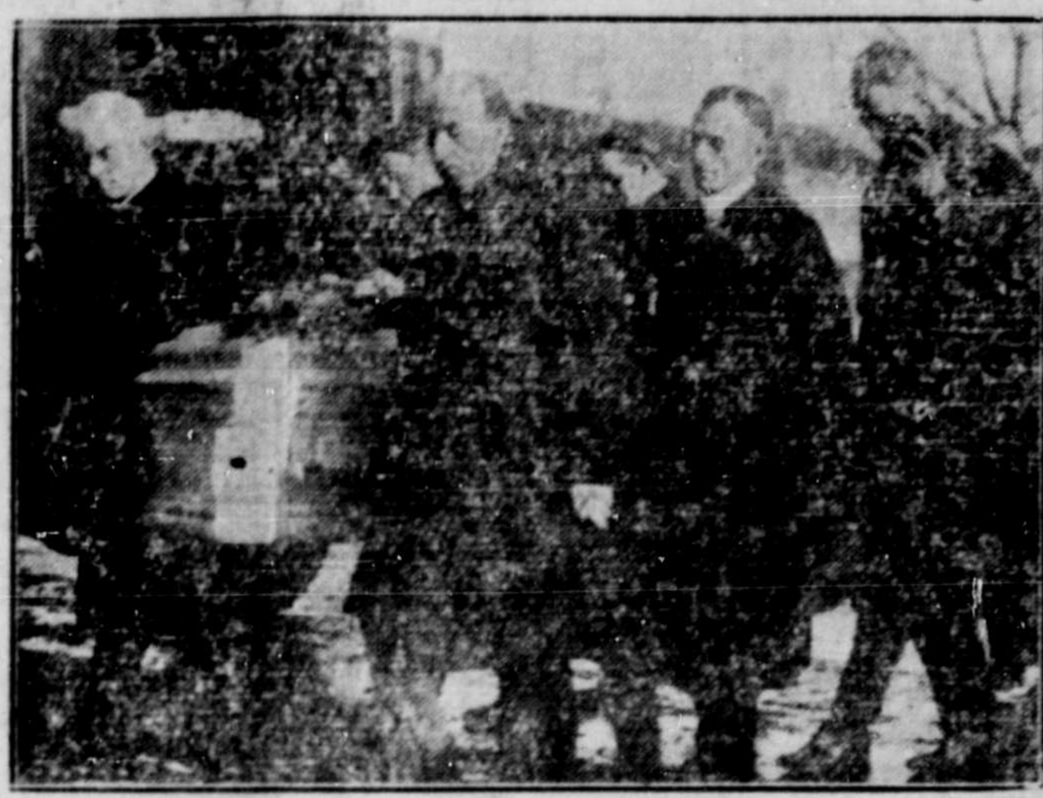
Photo shows the funeral procession of James Huffley, officer of the temperance department who dies as a result of wounds received when he was shot during raids on bootleggers in Winnipeg.