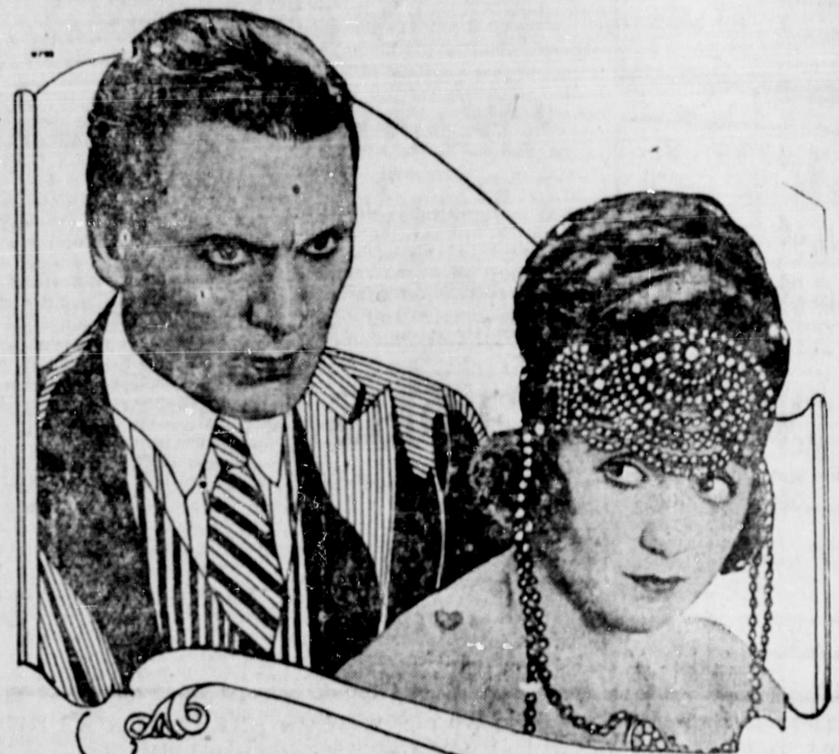
THOMAS MEIGHAN and BEBE DANIELS in a scene from CECIL B. DE MILLE'S PRODUCTION "WHY CHANGE YOUR WIFE?" A PARAMOUNT ARTICRAFT PICTURE