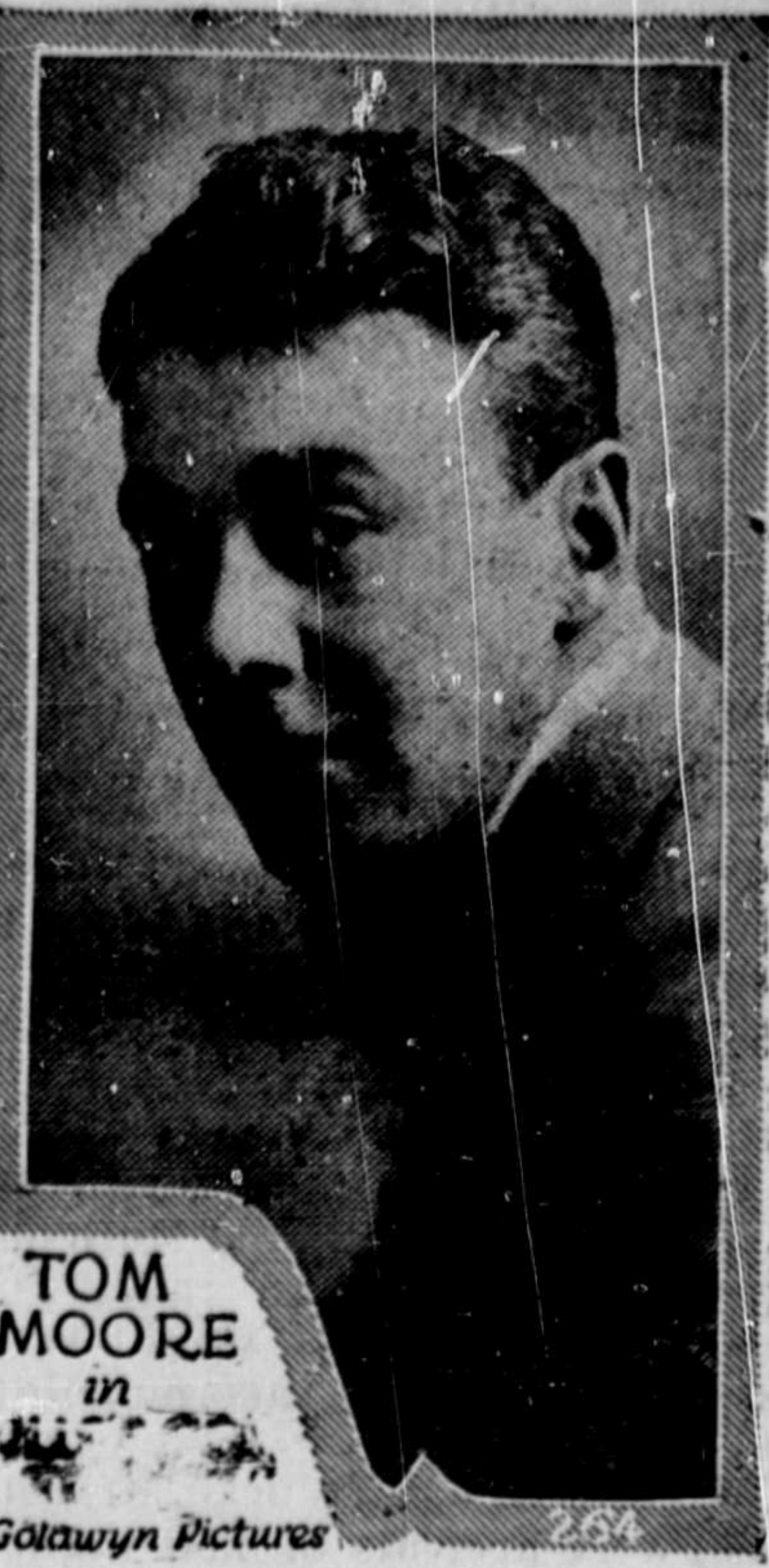
TOM MOORE in Gala Pictures At the Westholme Tonight.