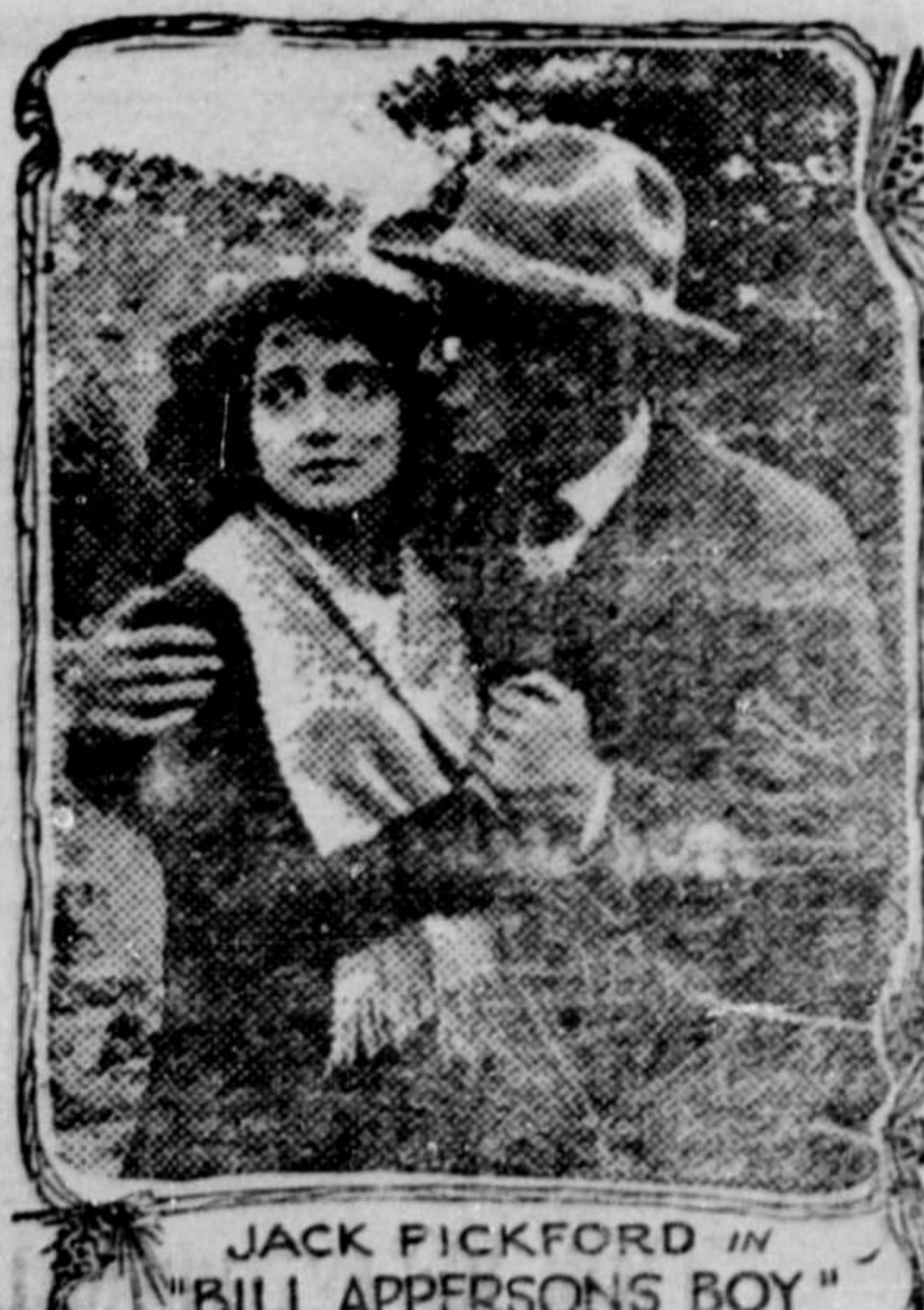
JACK PICKFORD in "BILL APPERSON'S BOY" At the Westholme Tonight.

Three days' Carnival or Bargains—Wallace's Sale. 13