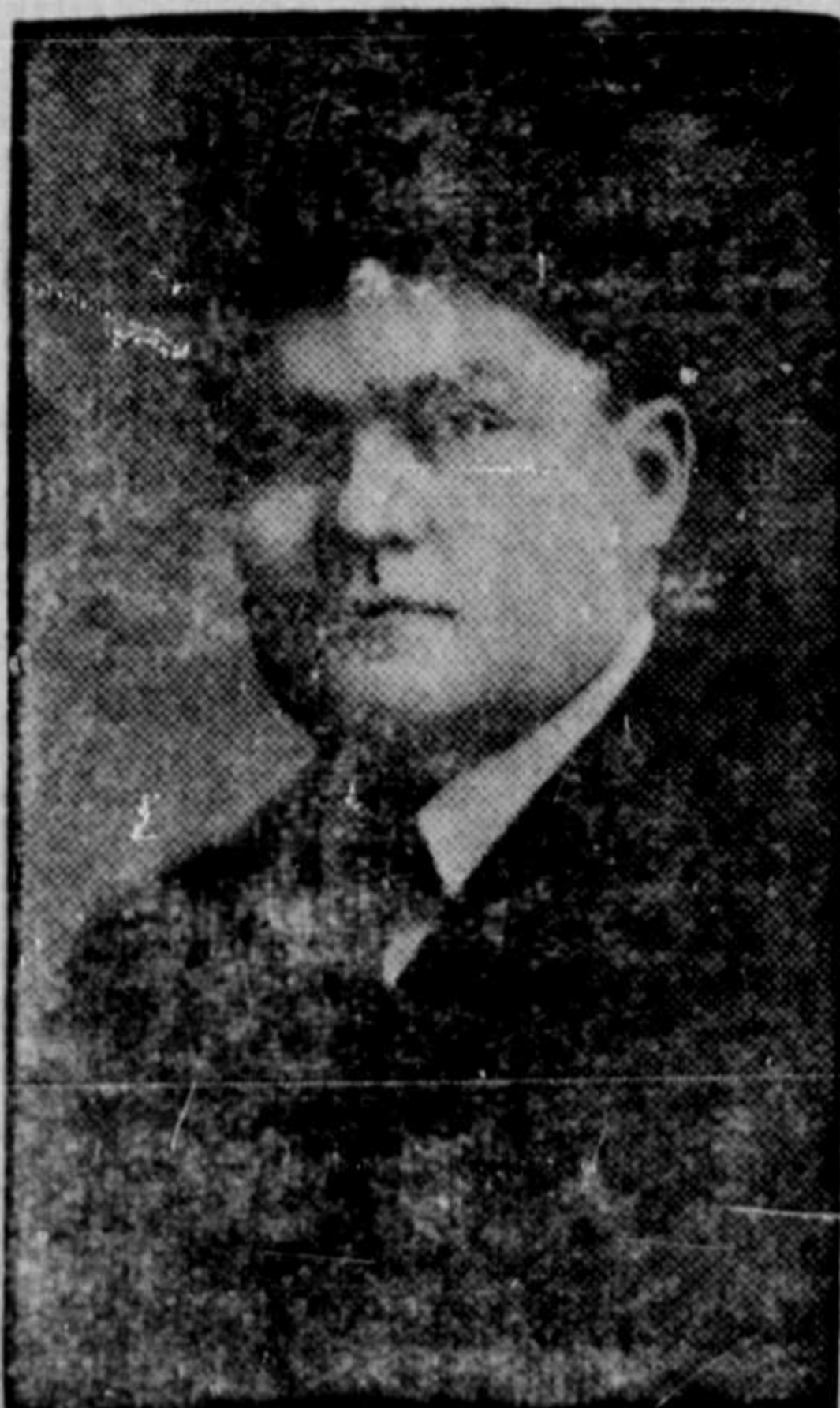
W. R. ROSS Member of the Legislature for Prince George and former Minister of Lands.

Sir Edmund stated that exchange conditions were serious. "No money can be expected from Great Britain until exchange conditions change."