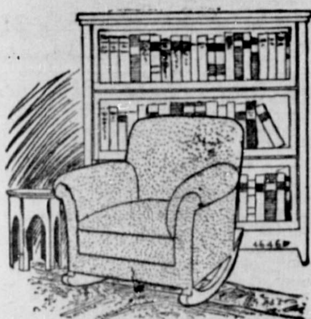
UPHOLSTERED SETTEES AND EASY CHAIRS AT GREATLY REDUCED PRICES

Dining Chairs, 1 armchair and 5 small, Golden Empire Oak, padded seats; regular value, $42.50. Sale Price $37.00 Dining Chairs, 1 armchair and 5 small, solid Golden Oak, regular; value $43.50— Sale Price $35.00 Dining Chairs, 1 armchair and 5 small, upholstered padded seats. Golden or Fumed Oak; regular value $55.00— Sale Price $45.00 Dining Chairs, set of six. Leather seats, regular value, $65.00. Sale Price $55.00 Dining Chairs, set of six, full upholstered leather seats, regular value $90.00 Sale Price $76.50