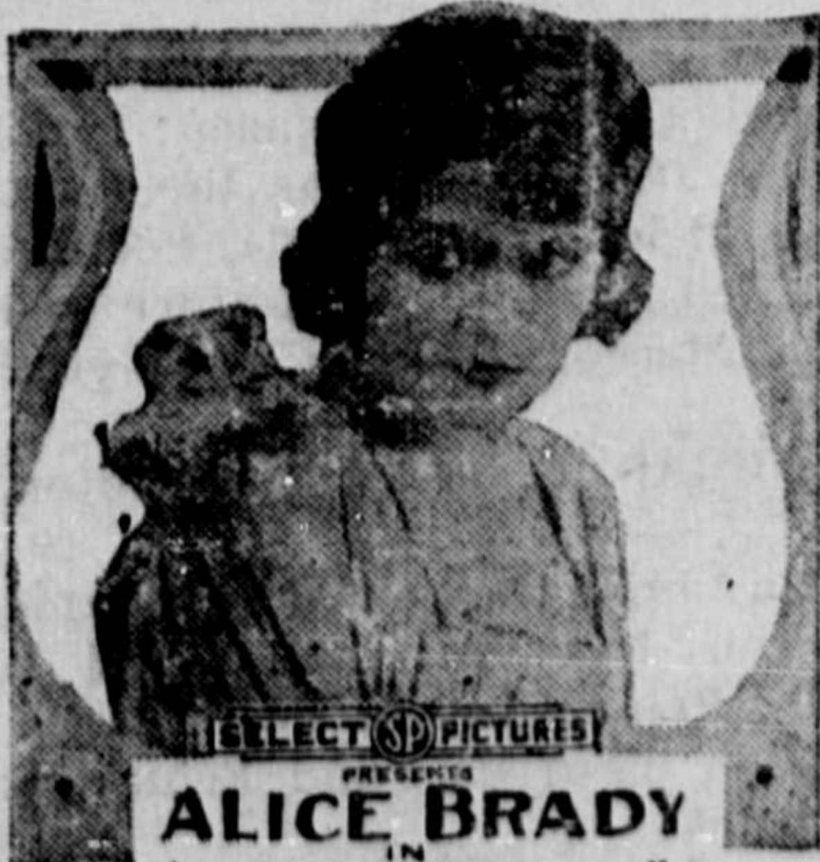
ALICE BRADY "THE WORLD TO LIVE IN"