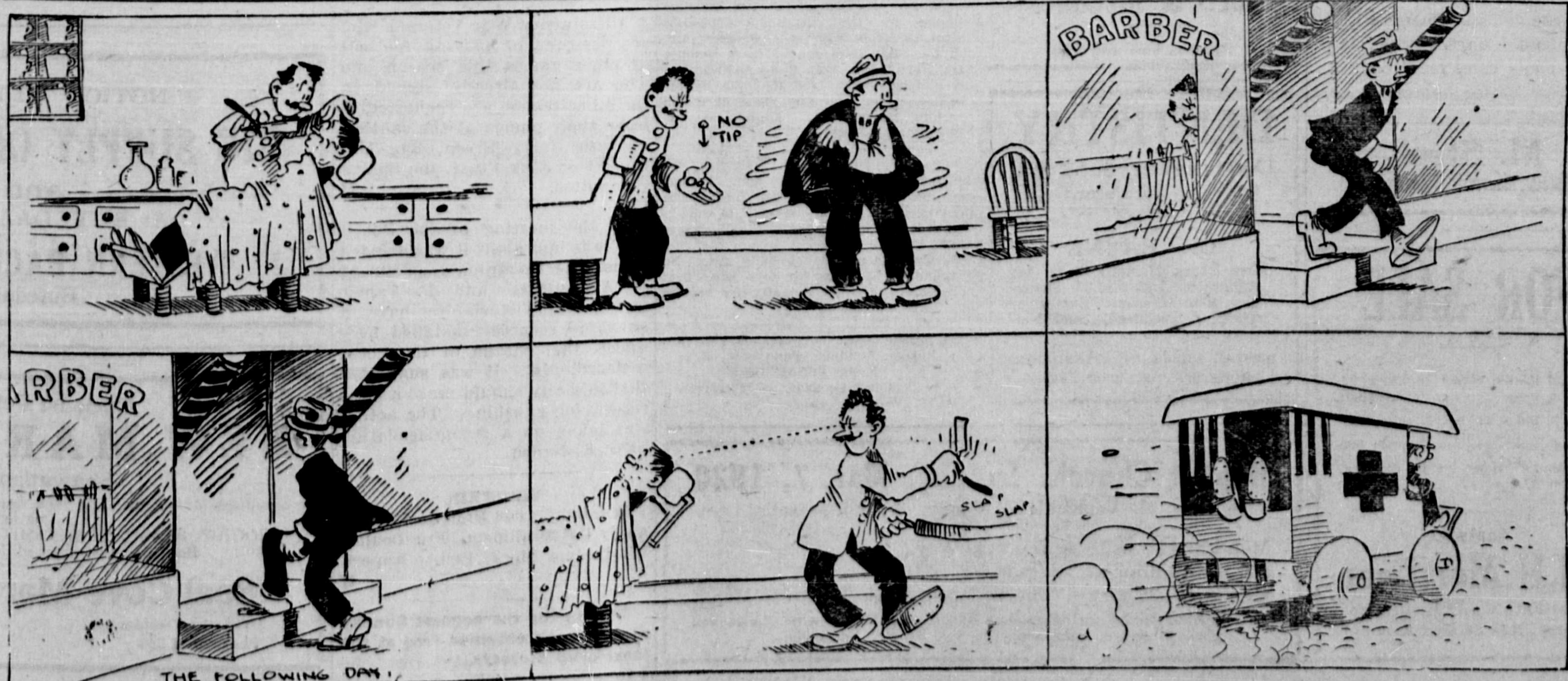
THE FOLLOWING DAY.

One (1) year will be allowed for removal of timber. Further particulars of the Chief Forester, Victoria, B. C., or District Forester, Prince Rupert, B. C.