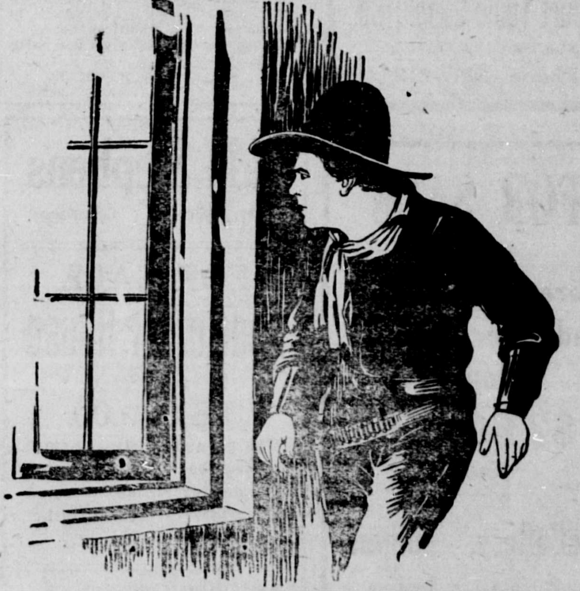
WM. FARNUM in "THE LONE STAR RANGER" at the Westholme Tonight and Tomorrow