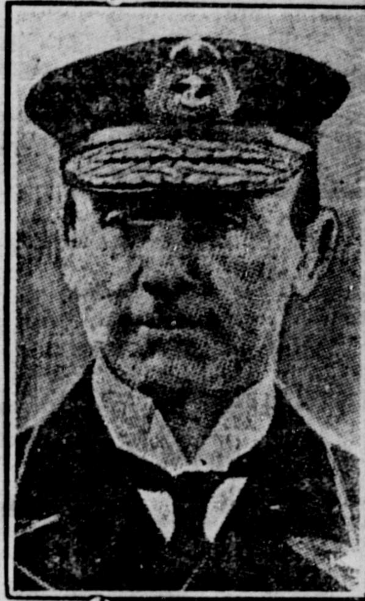
Viscount Jellicoe of Scapa and Admiral Beatty. Jellicoe's recommendations to the Canadian Government are under consideration.