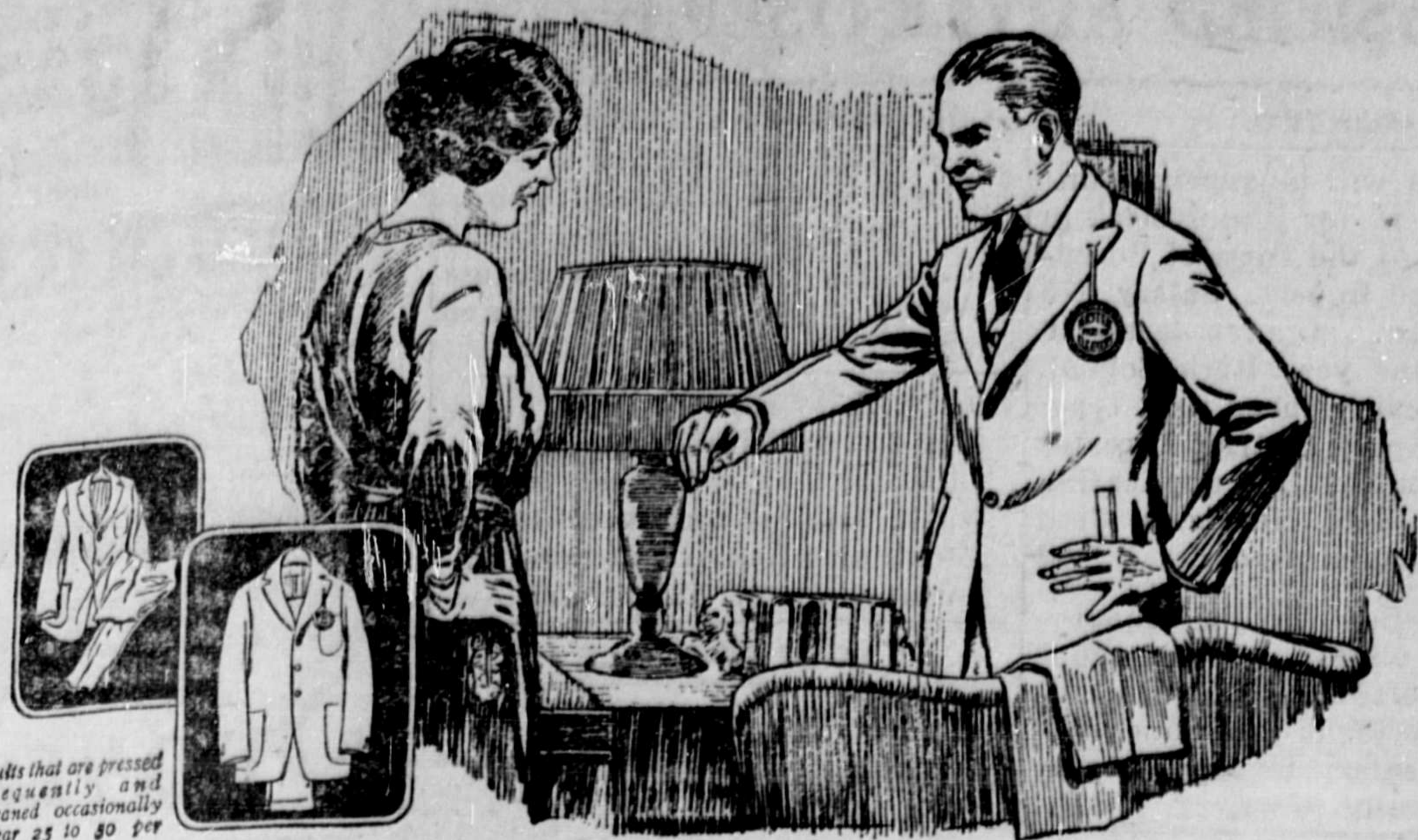
Suits that are pressed frequently and cleaned occasionally wear 25 to 50 per cent longer.