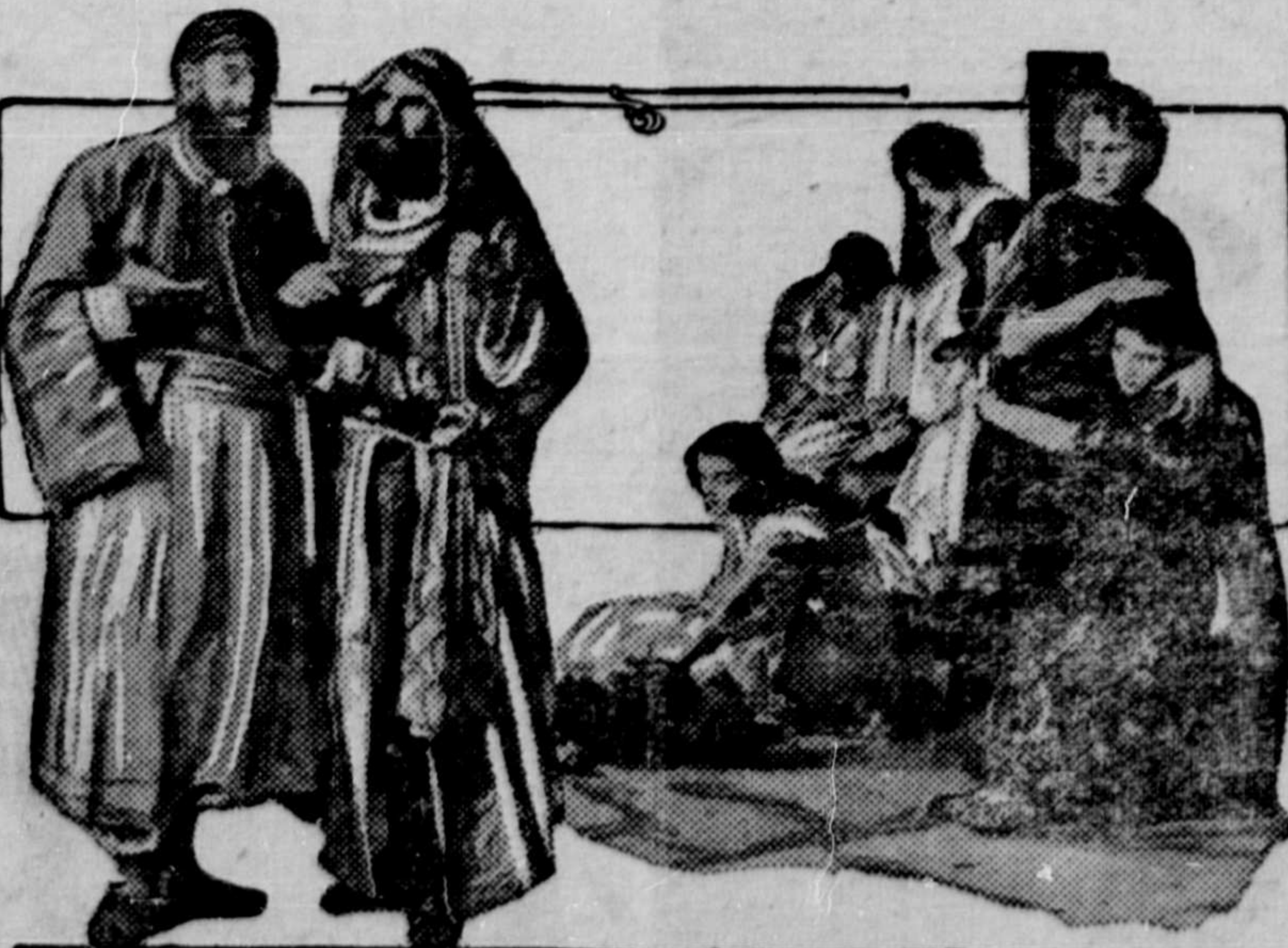
In the slave market at Kep-Abhur Scene from "Auction of Souls"