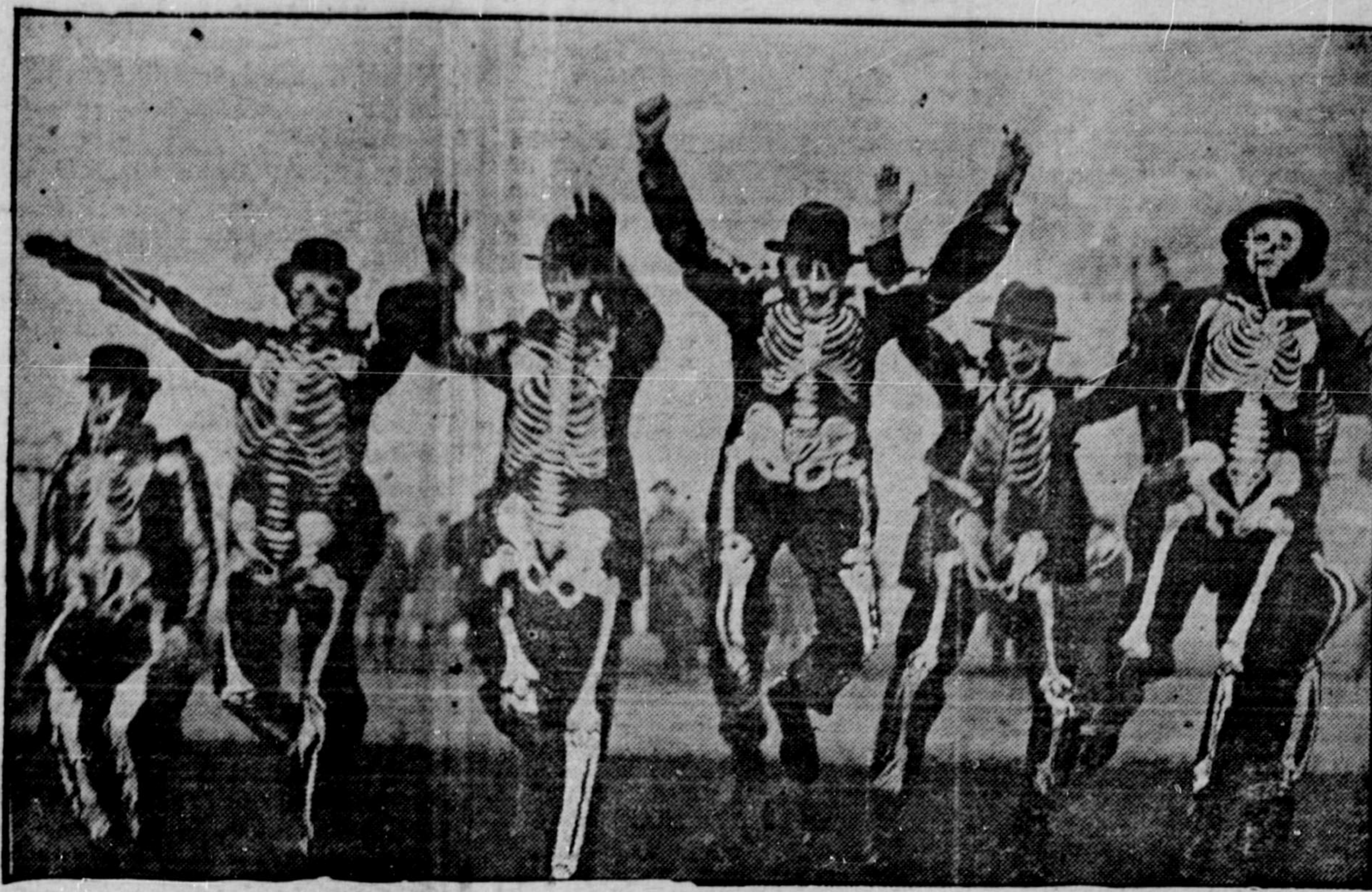
In England the other day the students of Guy's and St. Mary's Hospital met on the gridiron for the Rugby Cup. Just before the game some of the embryo medics disguised themselves as skeletons, and paraded up and down the field in dead line-up much to the amusement of the spectators.