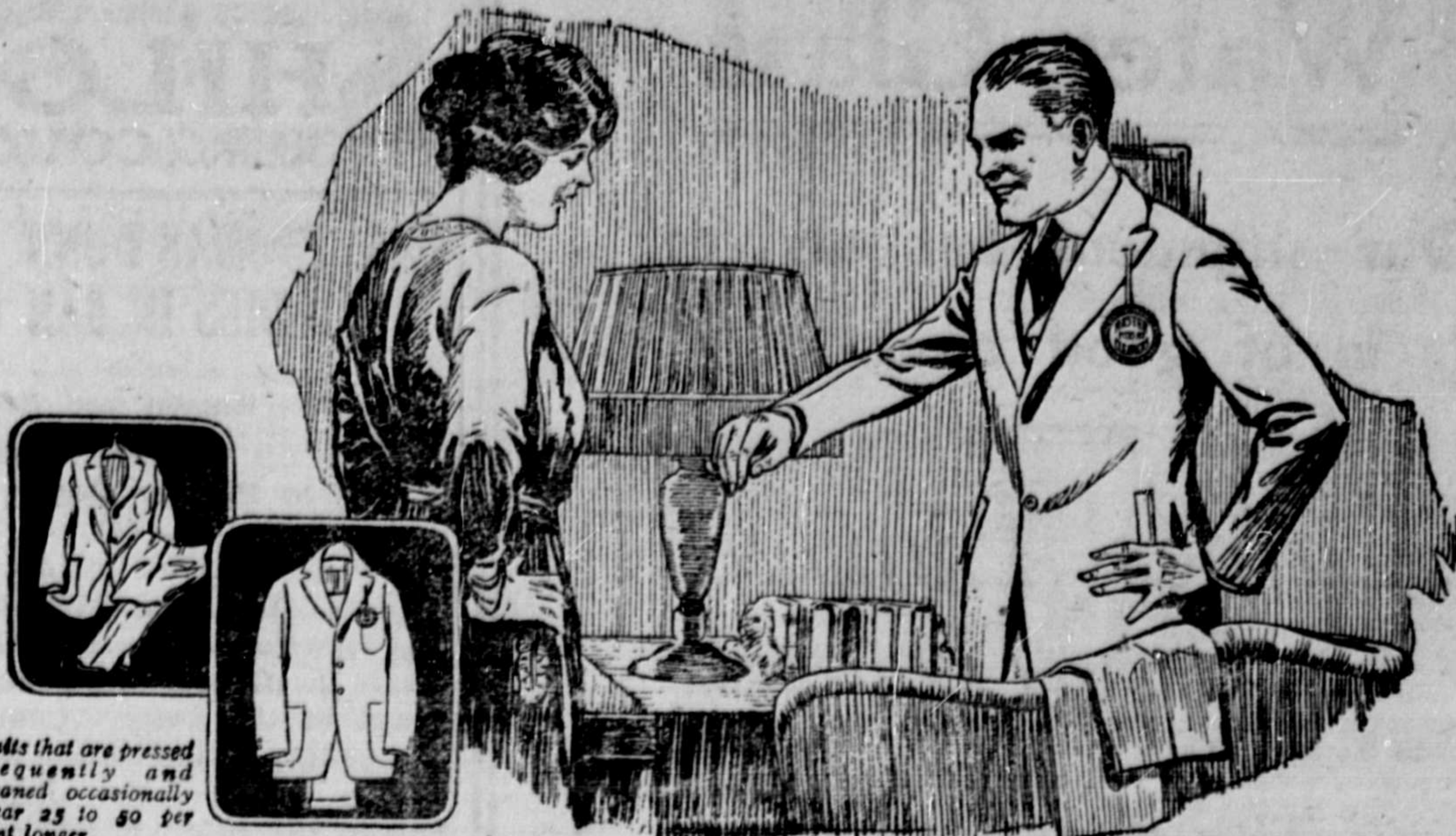
Suits that are pressed frequently and cleaned occasionally wear as long as 50 per cent longer.