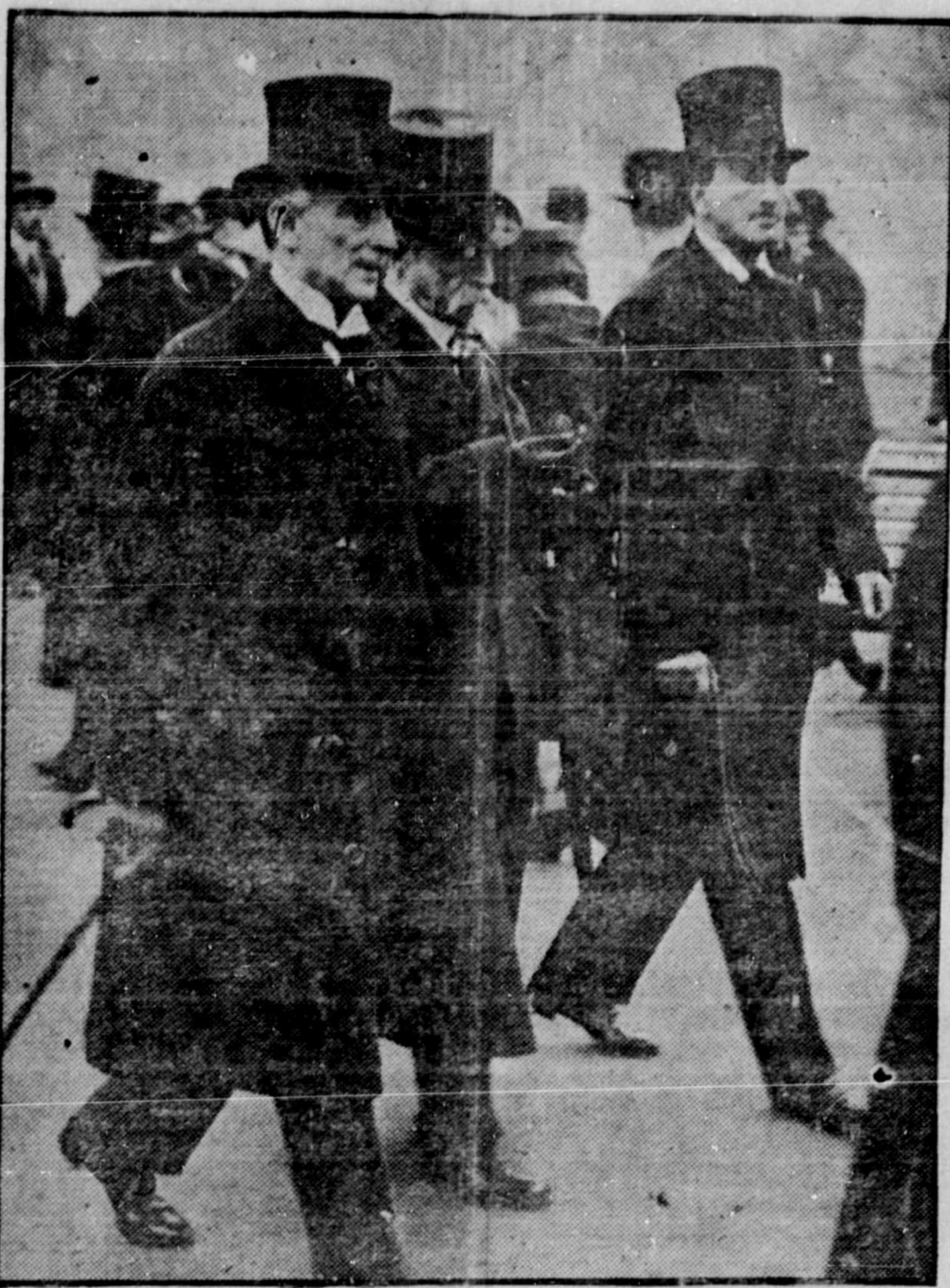
This is the latest photo of the Earl of Reading, former Minister to the United States, taken while he took a stroll in Hyde Park, London, with a friend.