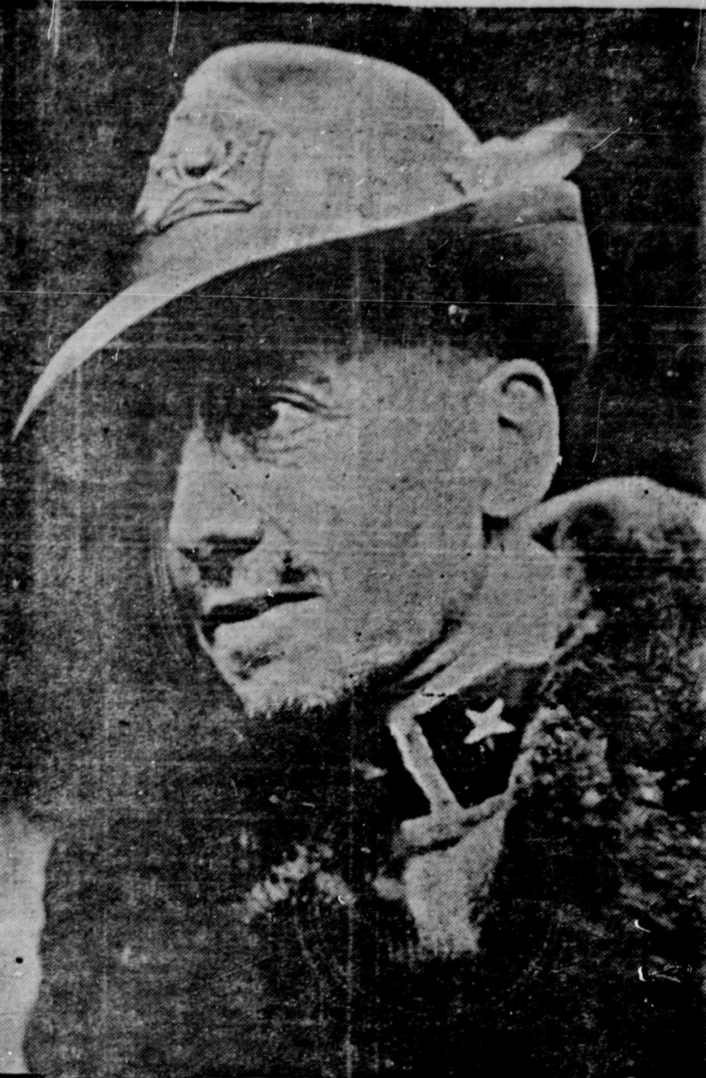
This photograph, which was taken recently in Fiume, is the latest of the famous airman-poet, Gabriel D'Annunzio, in a very characteristic pose.