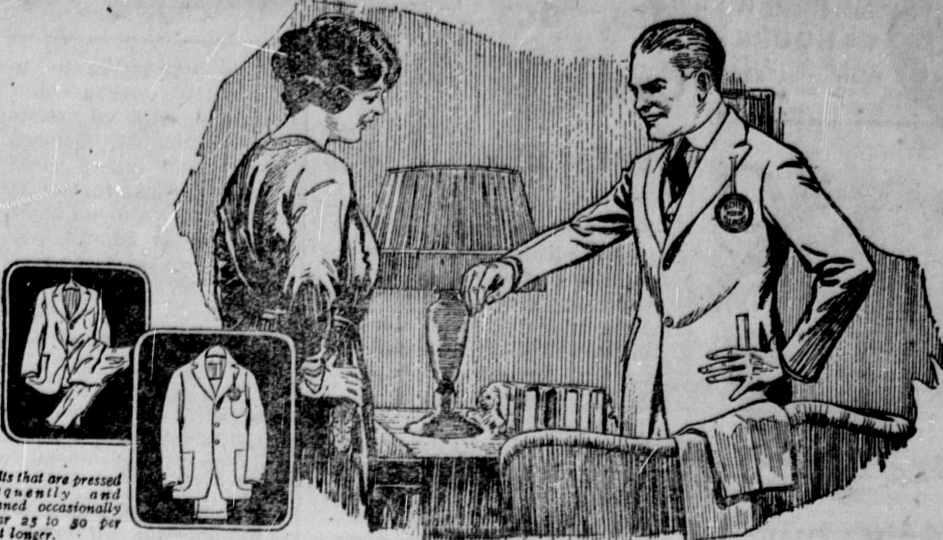
Suits that are pressed frequently and cleaned occasionally wear as long as 50 per cent longer.

Fishing Grievance. One of the sorest grievances seems to be the restrictions laid upon the Indians in regard to fishing and hunting. Mr. Teit told (Continued on Page Five.)