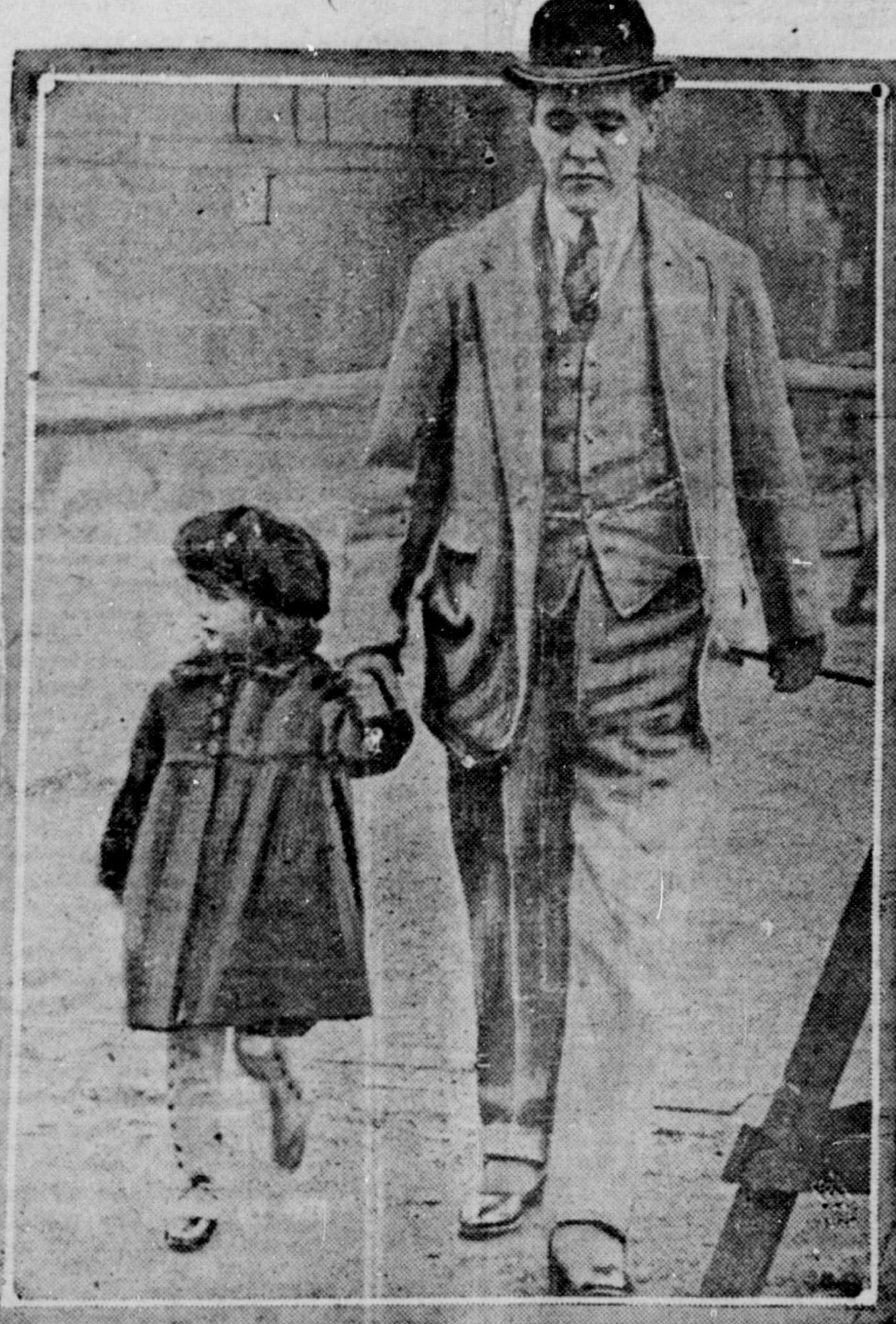
Lord Birkenhead, who is shown with his daughter on a stroll in Hyde Park, London, presides over the House of Lords in his function as Lord Chancellor. He is better known in America as Sir F. E. Smith.