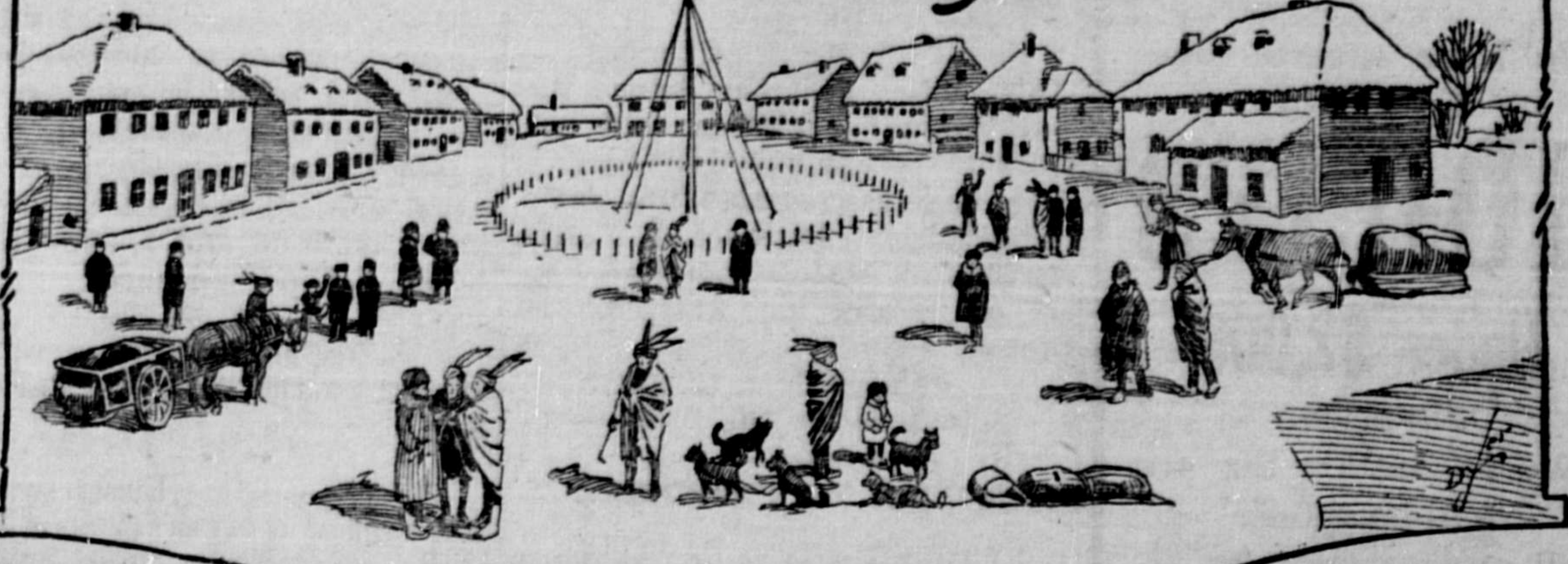
OLD FORT GARRY—WINNIPEG

Two Sizes 15¢ and 20¢ Where East meets West—Everywhere a Favorite