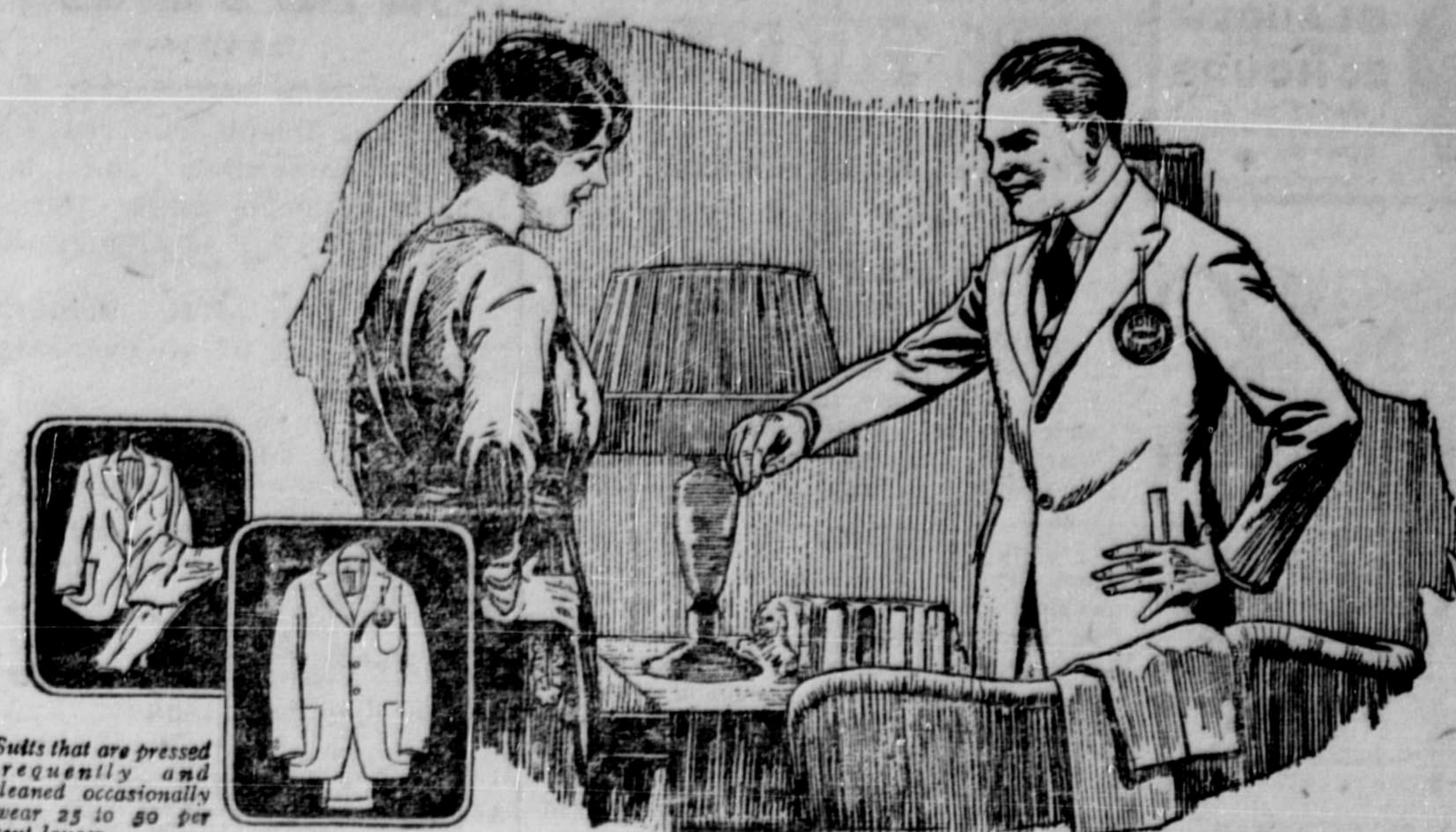
Suits that are pressed frequently and cleaned occasionally wear 25 to 50 per cent longer.