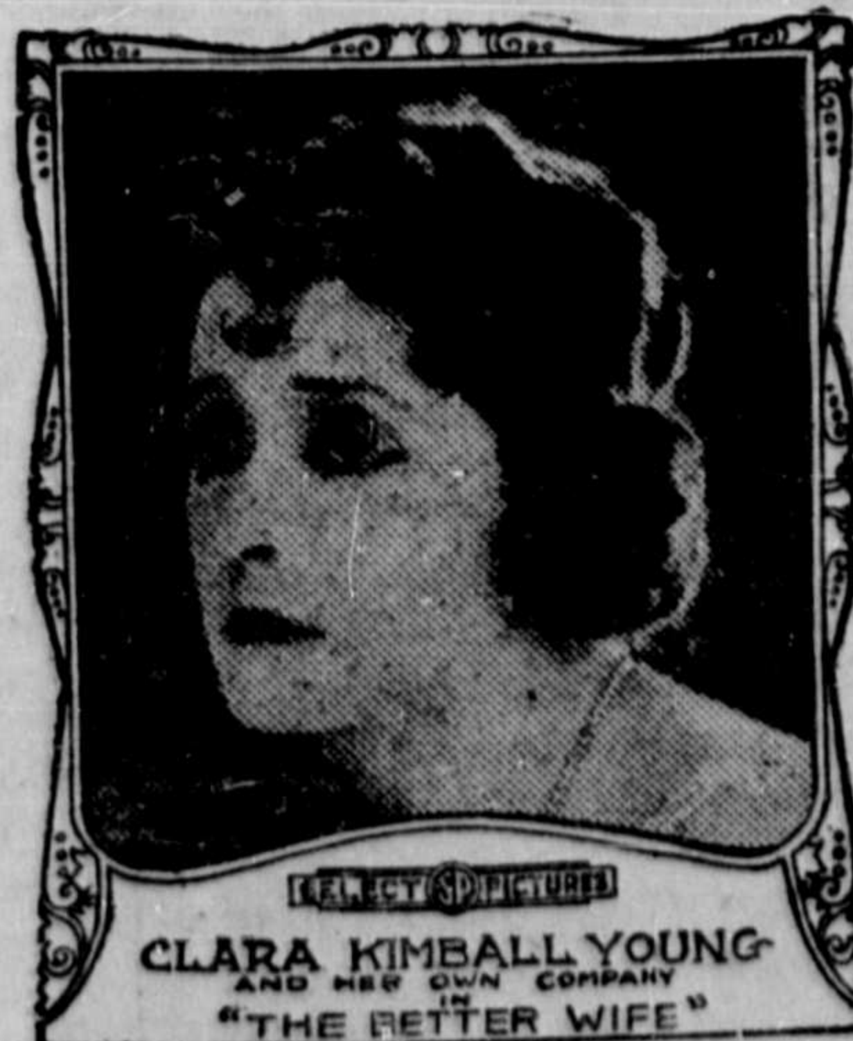
CLARA KIMBALL YOUNG "THE BETTER WIFE"