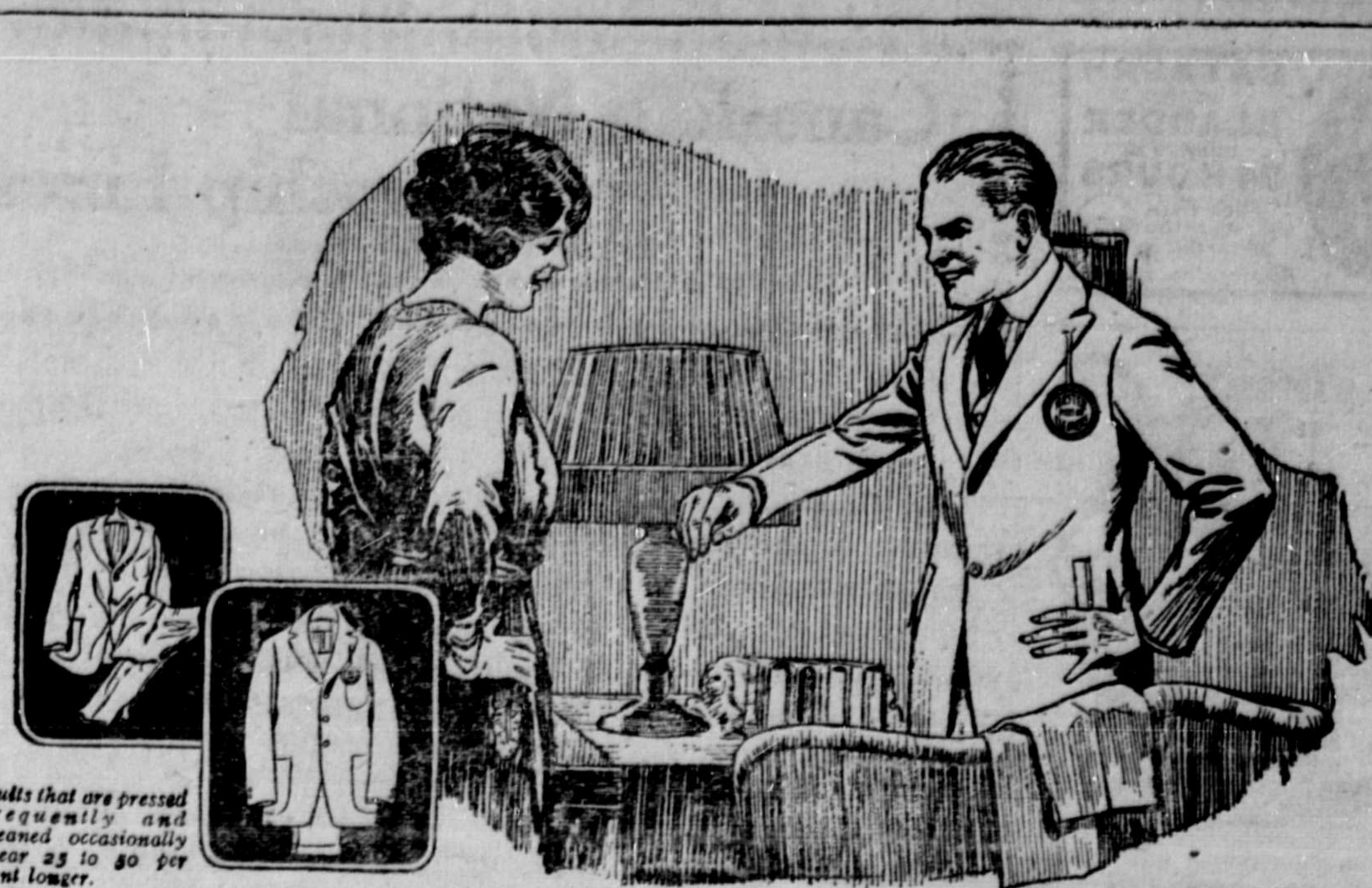
Suits that are pressed frequently and cleaned occasionally wear 25 to 50 per cent longer.