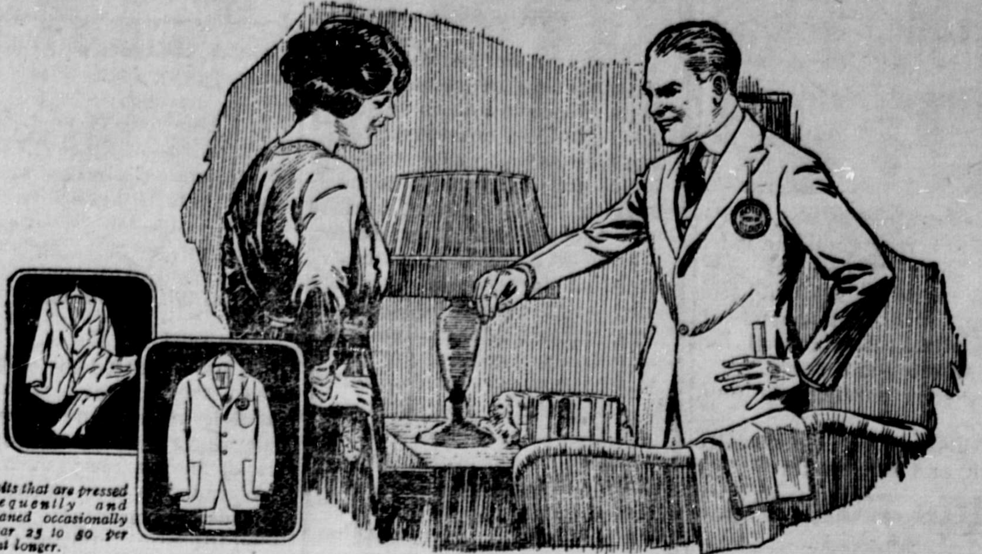
Suits that are pressed frequently and cleaned occasionally wear 25 to 50 per cent longer.

For the important part of the affair, the catering, a good deal of credit is due to the ladies of