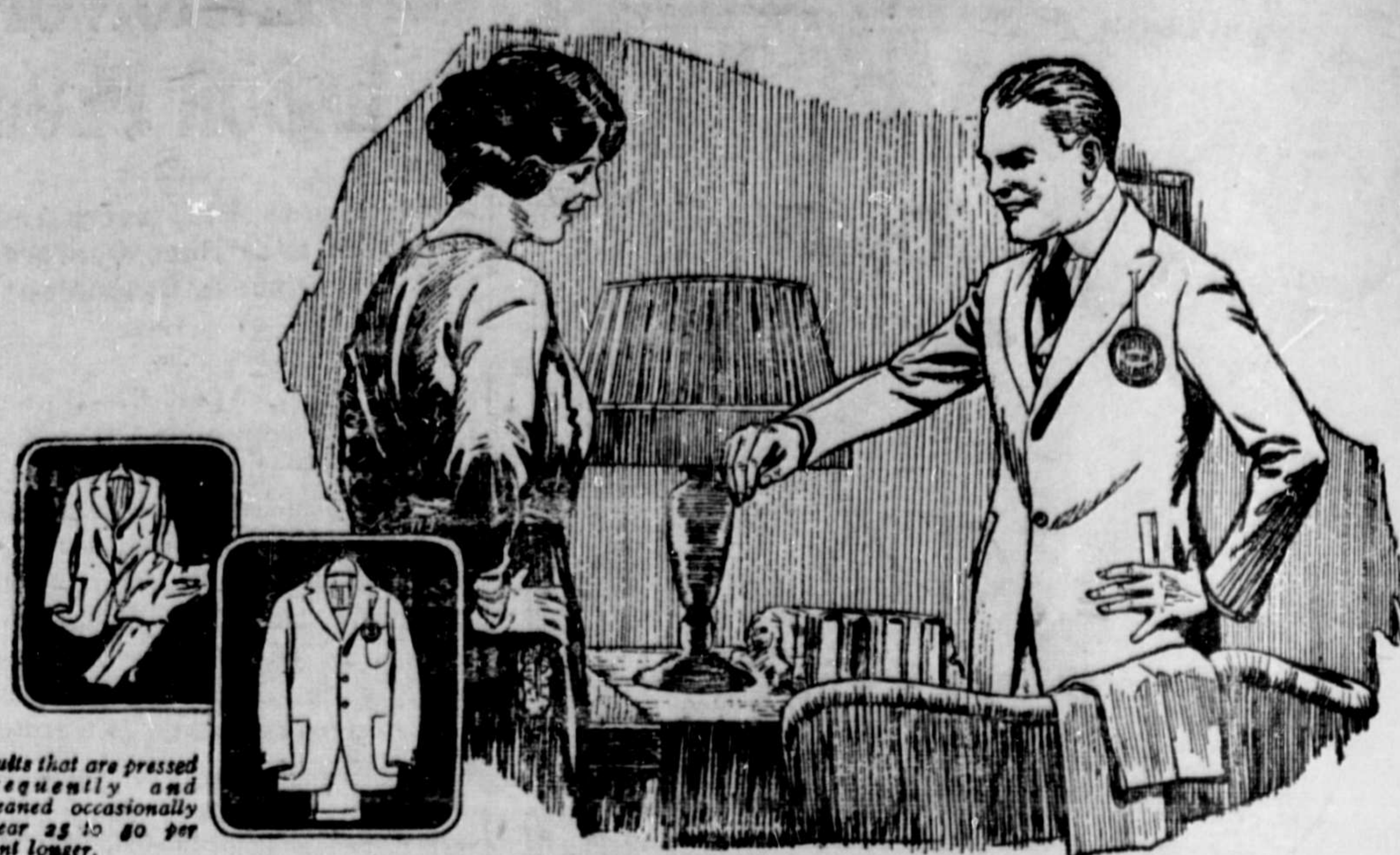
Suits that are pressed frequently and cleaned occasionally wear 25 to 50 per cent longer.

There may be something you want. See the classified column