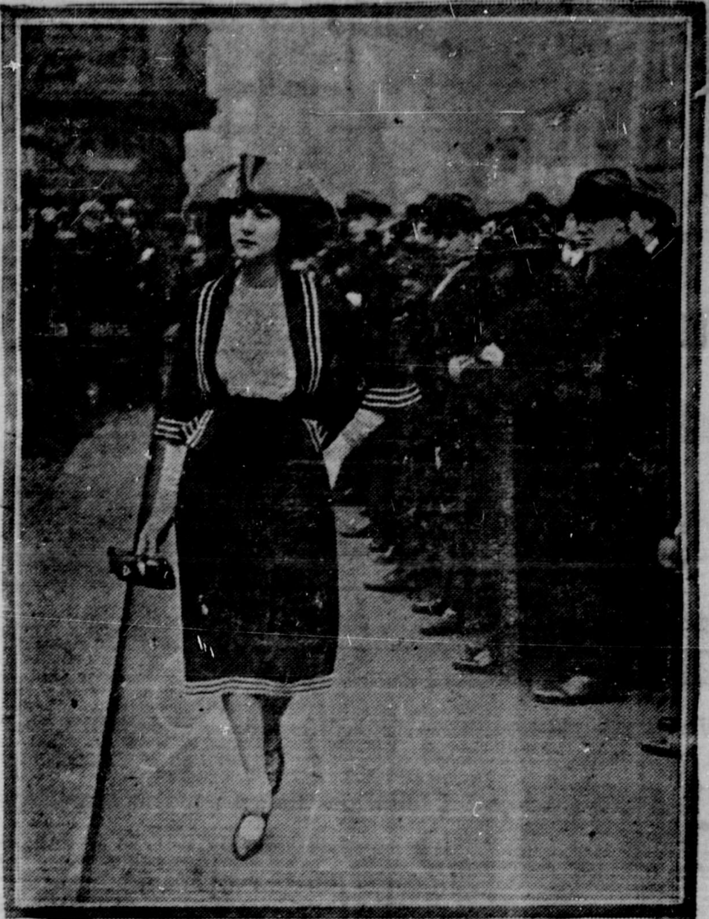
Why the crowd gathered when a young woman in an Eton coat suit show length sleeves and the new knee length skirt, walked down New York's fashionable thoroughfare