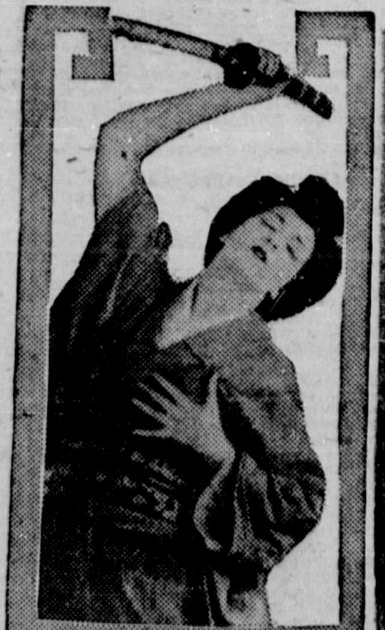
VIOLA DANA—THE WILLOW TREE At the Westholme Tonight.