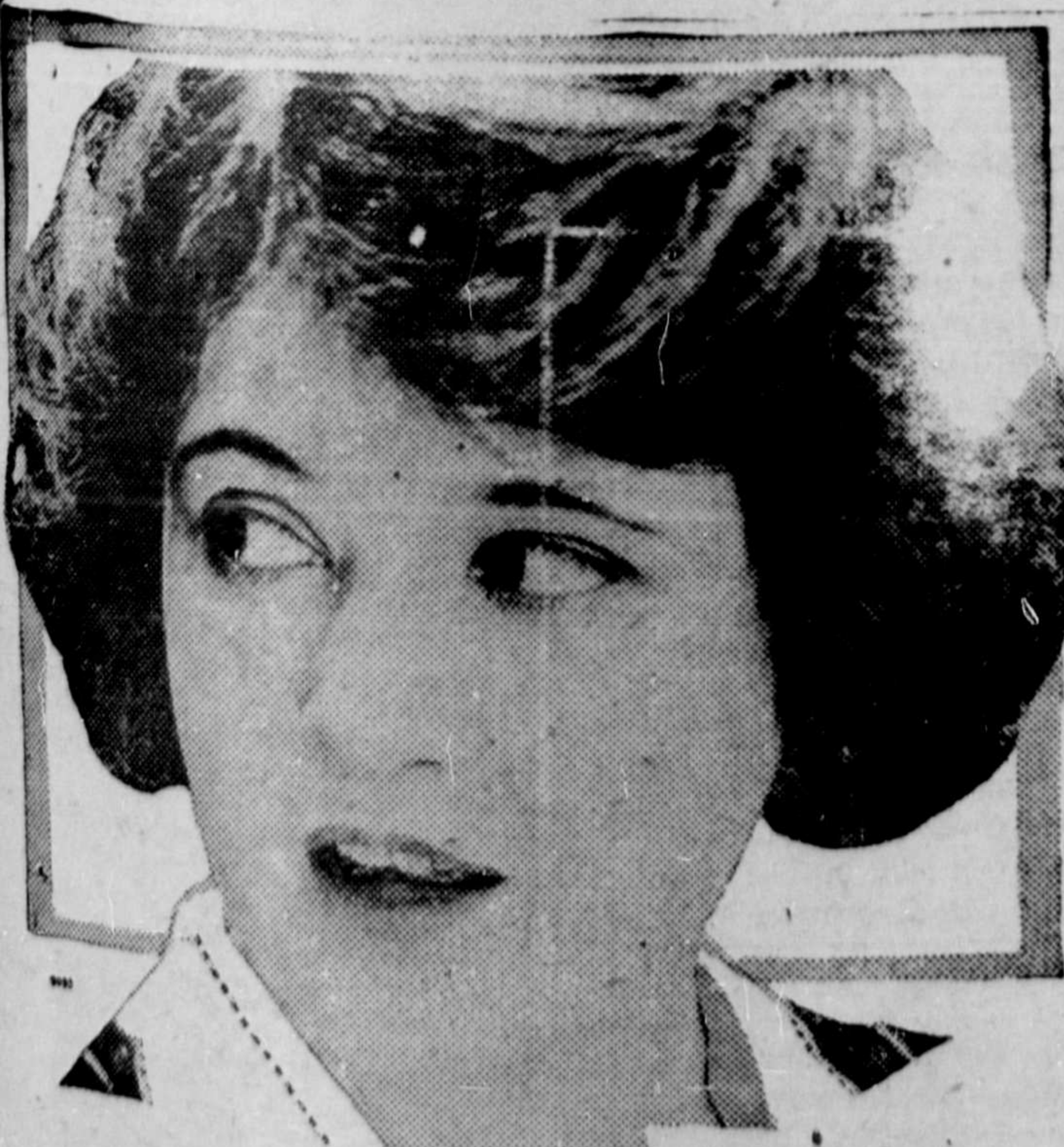
MARGUERITE CLARK "Girls"

MARINE INSURANCE REAL ESTATE FIRE INSURANCE Phone Blue 69 Westholme Theatre Block P. O. Box 66