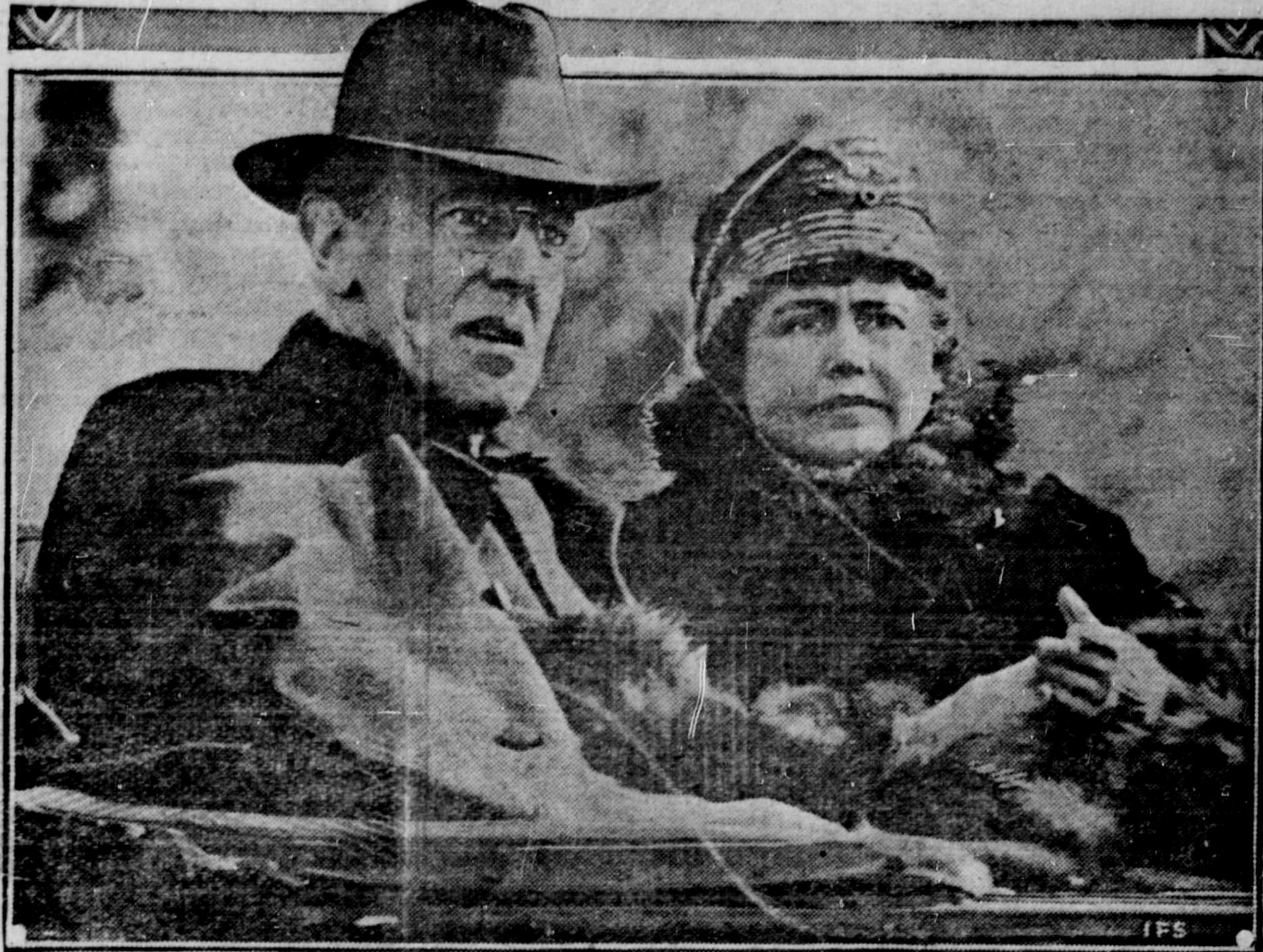
President Wilson posed for more than five minutes for motion picture men a few days ago as he was leaving the White House grounds for an automobile ride with his wife. The picture shows him somewhat thinner than before his illness.