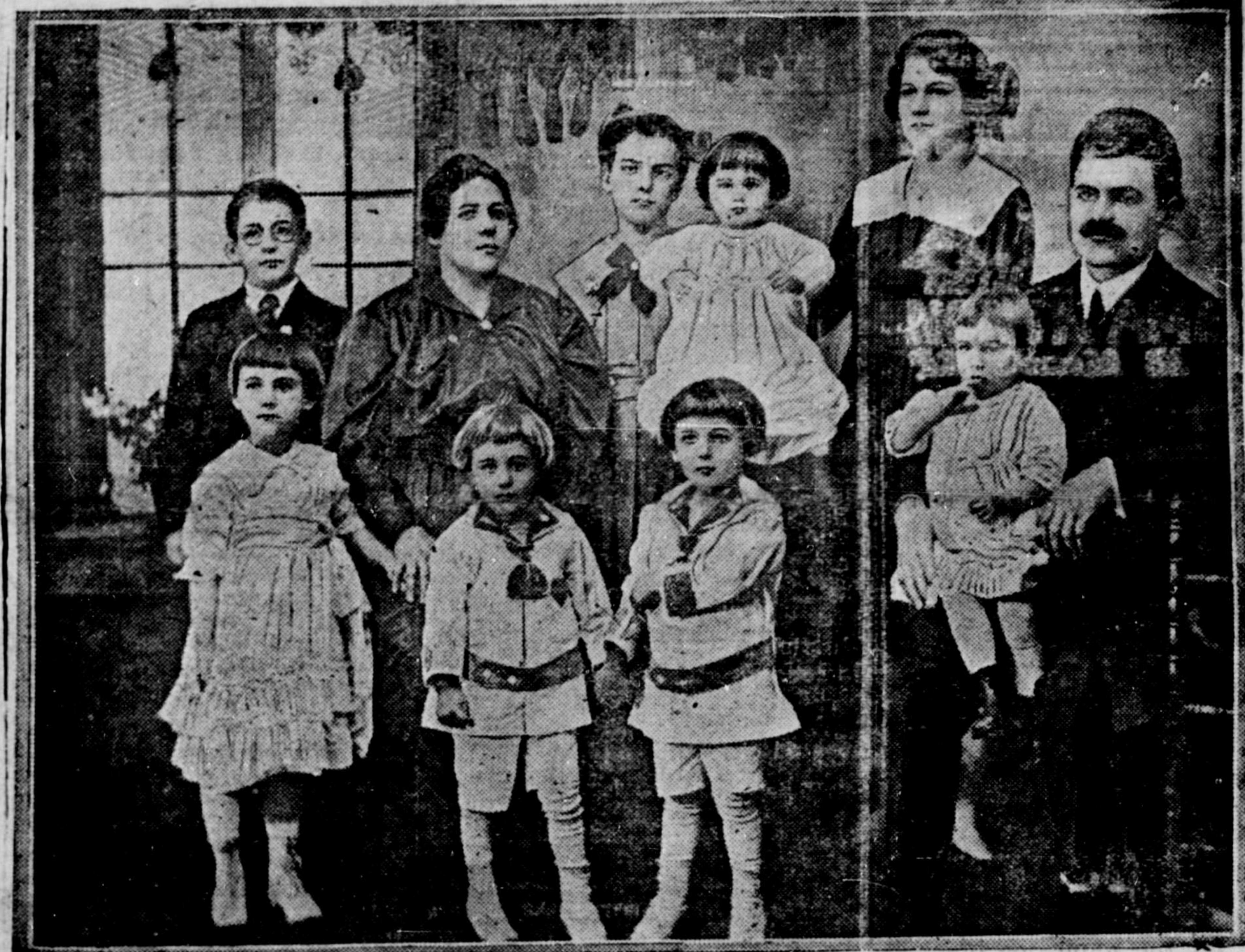
Eighty dollars is the sum a clergyman of a Hungarian Baptist church in New York city sets aside in his monthly household budget for food for his family of ten. Formerly he allowed $135 for this purpose until he found that from $80 to $90 was all that was necessary. As proof that his family are all properly nourished and unusually strong and healthy, the clergyman volunteers that in the last seven years he has spent less than $20 for medical care. He finds that shoes are a great problem. Little meat is consumed by the family, vegetables being a great help in lowering the cost.