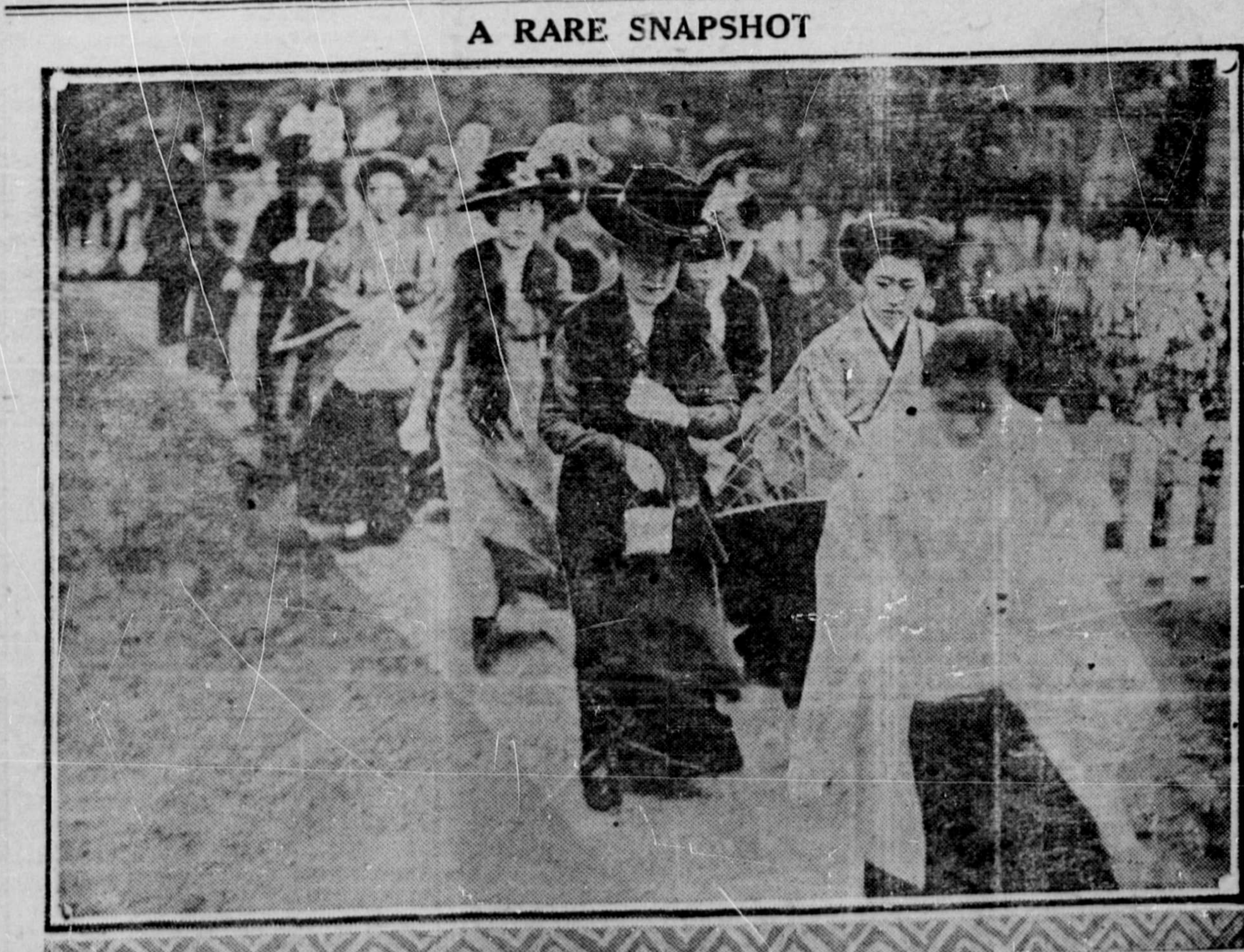
The woman in white leading the line of Japanese court ladies is the Lady Yanagizawa Ninotsuhara, mother of the Emperor of Japan, who rarely appears in public and whose photograph is almost unavailable. It is not generally known that the late Dowager Empress of Japan was not the mother of the present Emperor. The court ladies, on the occasion shown in the photograph, were visiting the Tokyo High Technical School. It will be noted that some of the ladies are in European clothes, while others are wearing the old court costume for ladies in Japan.

(Special to The News via G. T. P. Telegraphs.) DUBLIN, April 23.—Another crisis in the Irish problem appears at hand. Advance parties of cavalry have arrived in Dublin during the past few days, while the main body is expected tonight. There are warships in Dublin Bay and the arrival of transports with a destroyer is reported. BELFAST, April 23.—The removal of fifteen Sinn Fein prisoners from Belfast and a large number from Queenstown on three destroyers leads to the belief that the authorities are planning taking all Sinn Fein prisoners from Ireland. DUBLIN, April 23.—Many raids were made last evening by the military in villages around Dublin and also in town. No arrests are reported. The last hunger striker was removed from Mount Joy prison. He was taken to a hospital.