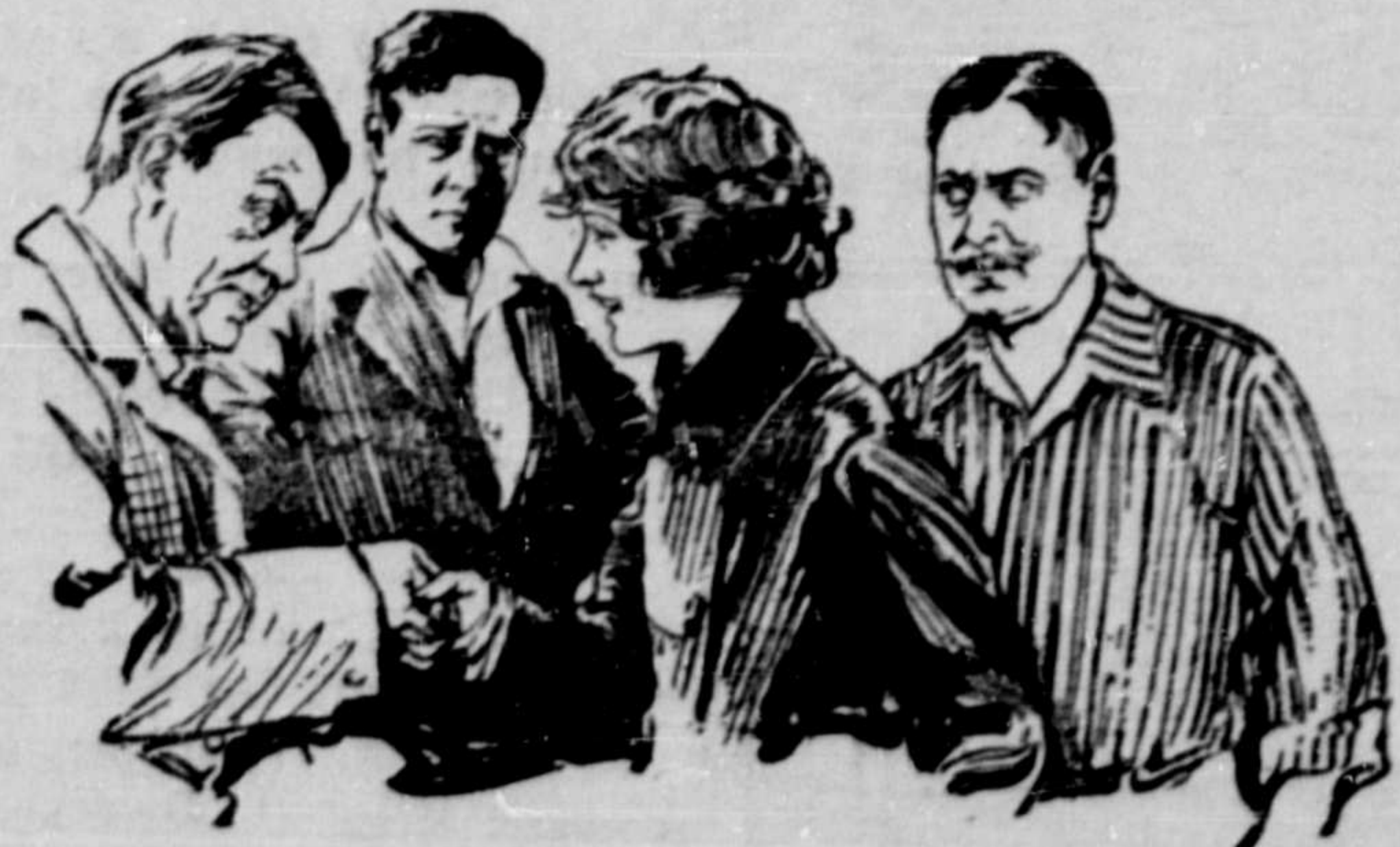
CONSTANCE TALMADGE in the saucy picture "Two Weeks" at the Westholme Tonight.

For a number of years the Prince Rupert has catered most effectively to the business of this city as a high class hotel. Now it is found that the business is growing to such an extent that more accommodation will be needed. The Grand Trunk Pacific Railway once made preparations to commence construction of a hotel building. Then came the hard times when such work was impossible. With the revival of business here the need has again arisen and with Government ownership comes responsibility in regard to these improvements. Whether the Government should build a hotel or lease the site is not certain. The difficulty would be to get private capital to finance anything so big as a first class hotel suitable for the business that will be offering here.