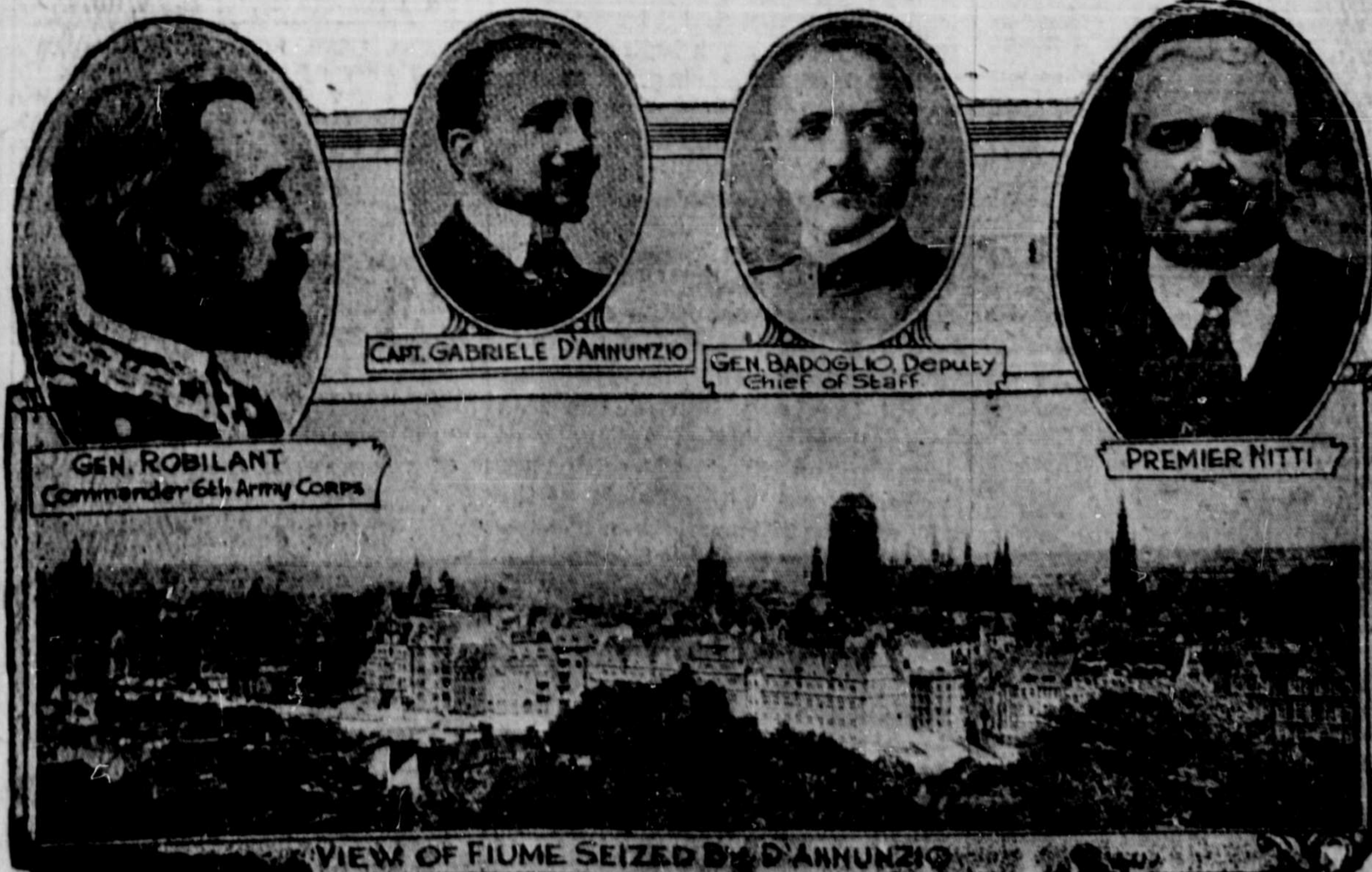
CITY OF FIUME which is being blockaded by the Allies.

Japan wants certain railway concessions, which the other three countries are unwilling to grant.