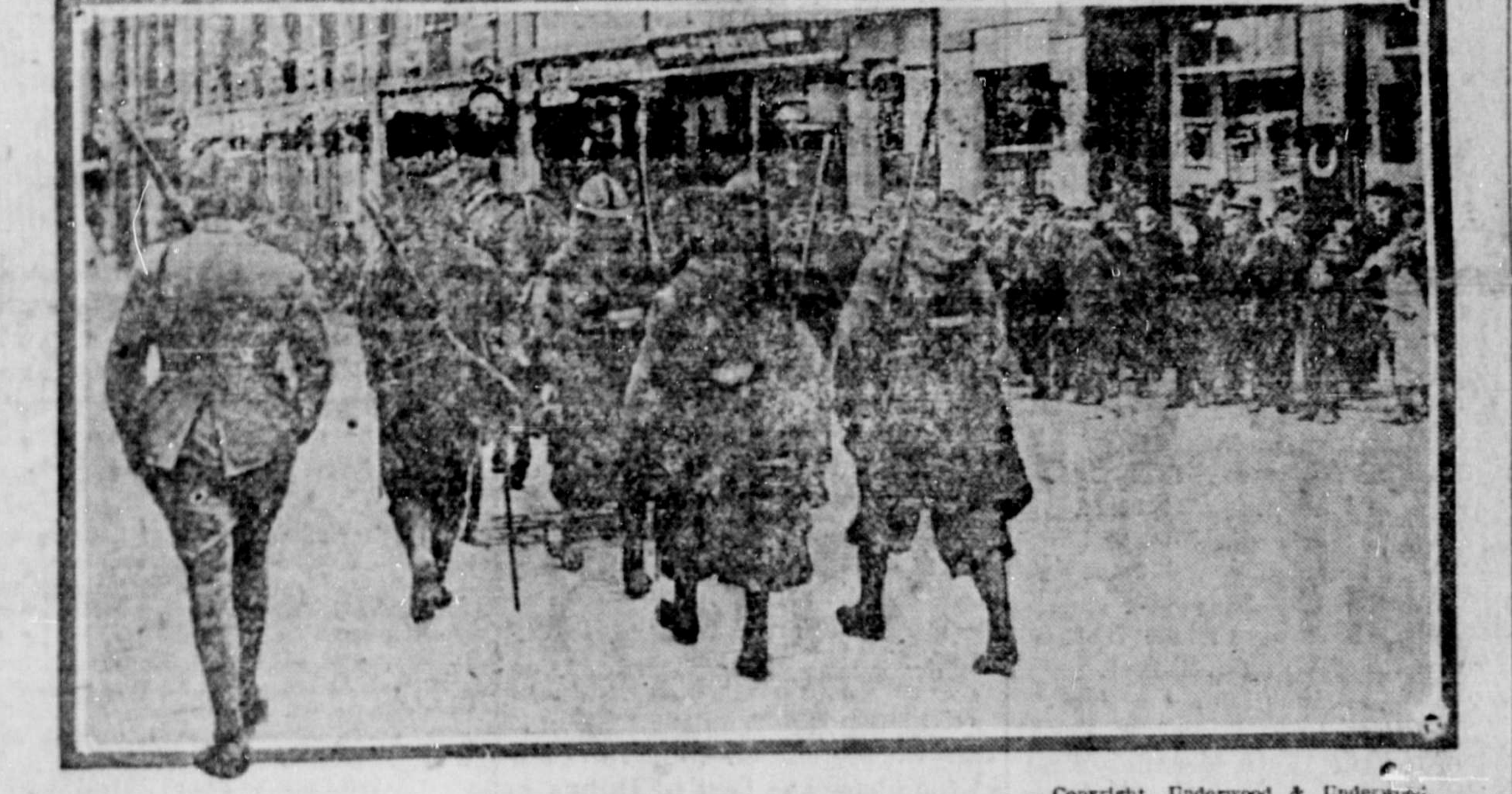
Photograph shows Tricolor patrol guarding a supply of food being taken to outposts scattered about the newly occupied German city.