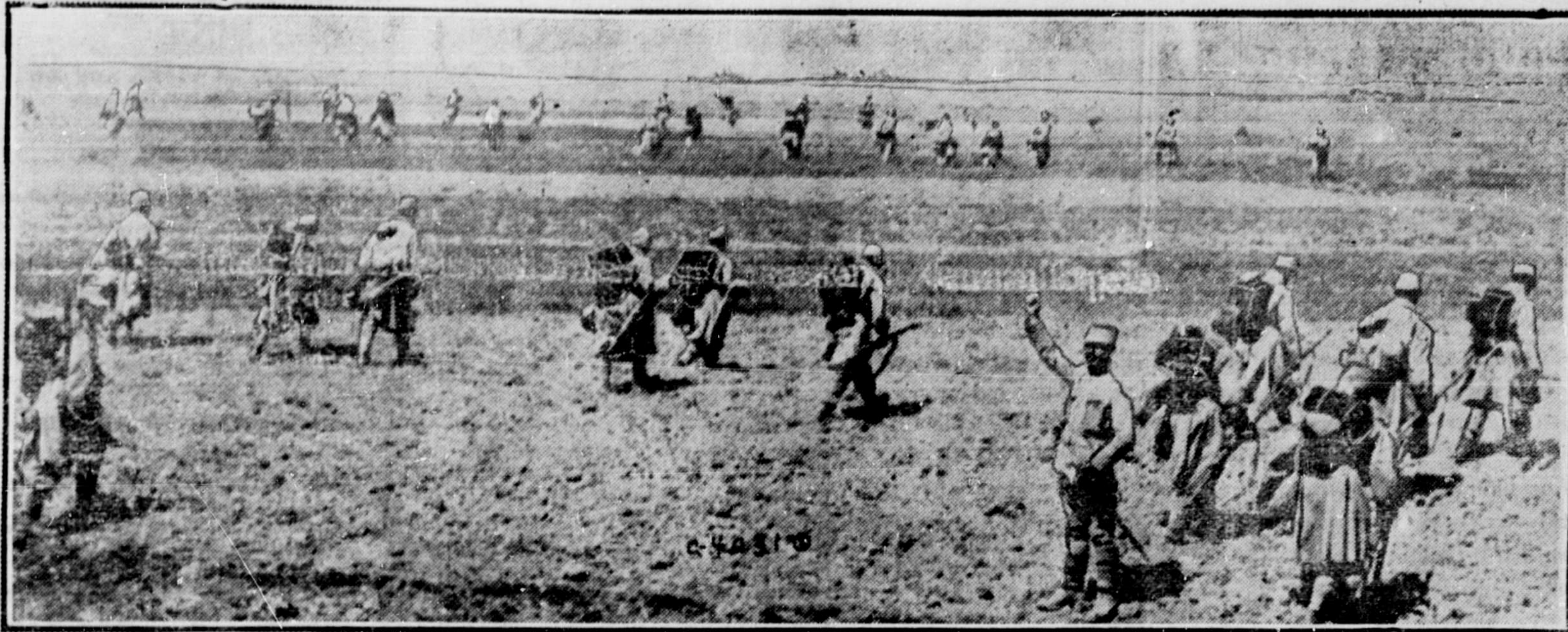
GERMANS ABANDON THE CLOSE FORMATION AS METHOD OF ADVANCE —This unusual picture was taken during the present campaign in Galicia, which has now extended over seven weeks. Observers report that in this advance the Germans have almost entirely abandoned their former rule of advance in close formation. In this picture the broken or open formation is illustrated. In the distance Russian shells can be seen exploding.