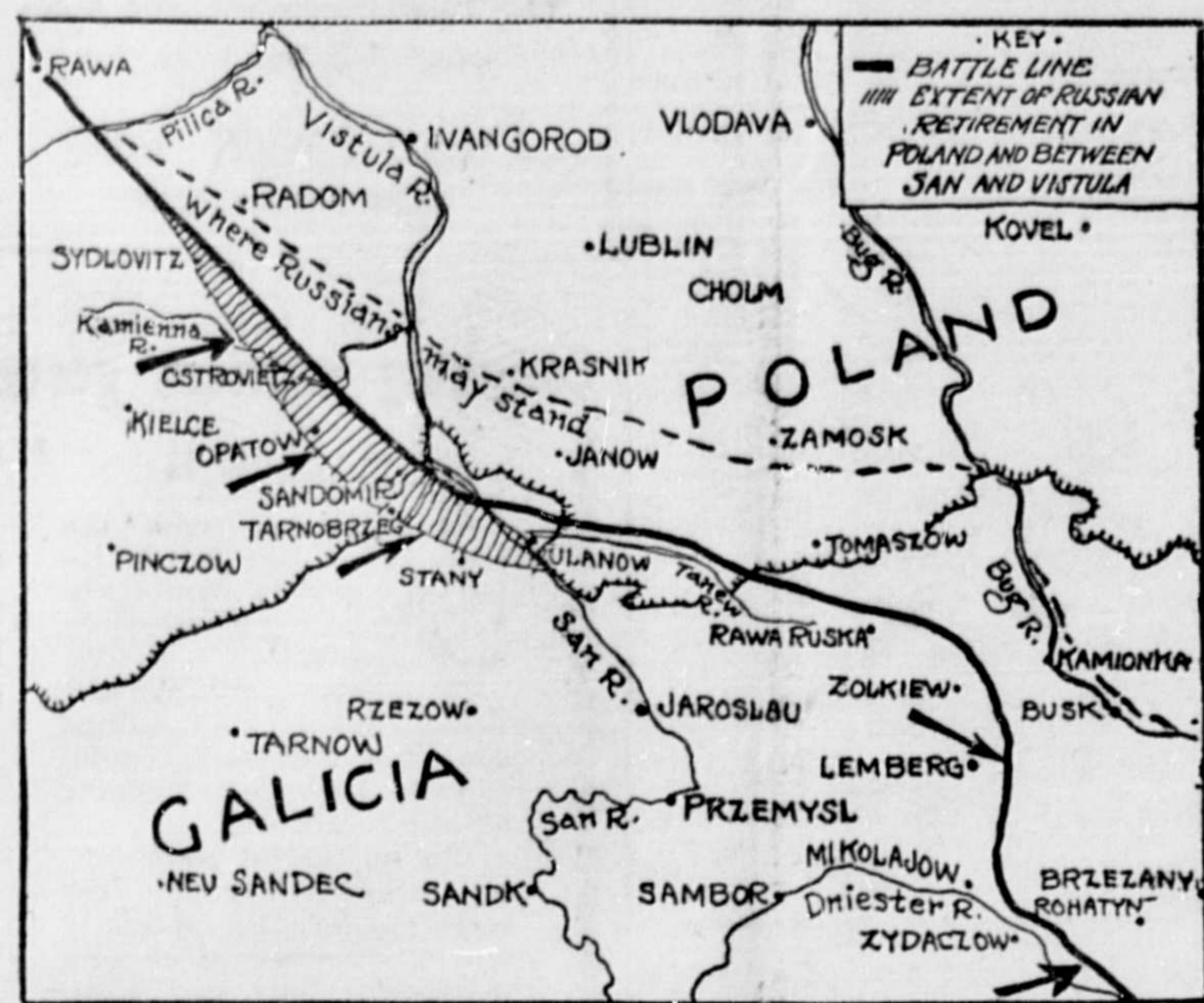
SHOWING THE LATEST SITUATION IN GALICIA AND POLAND