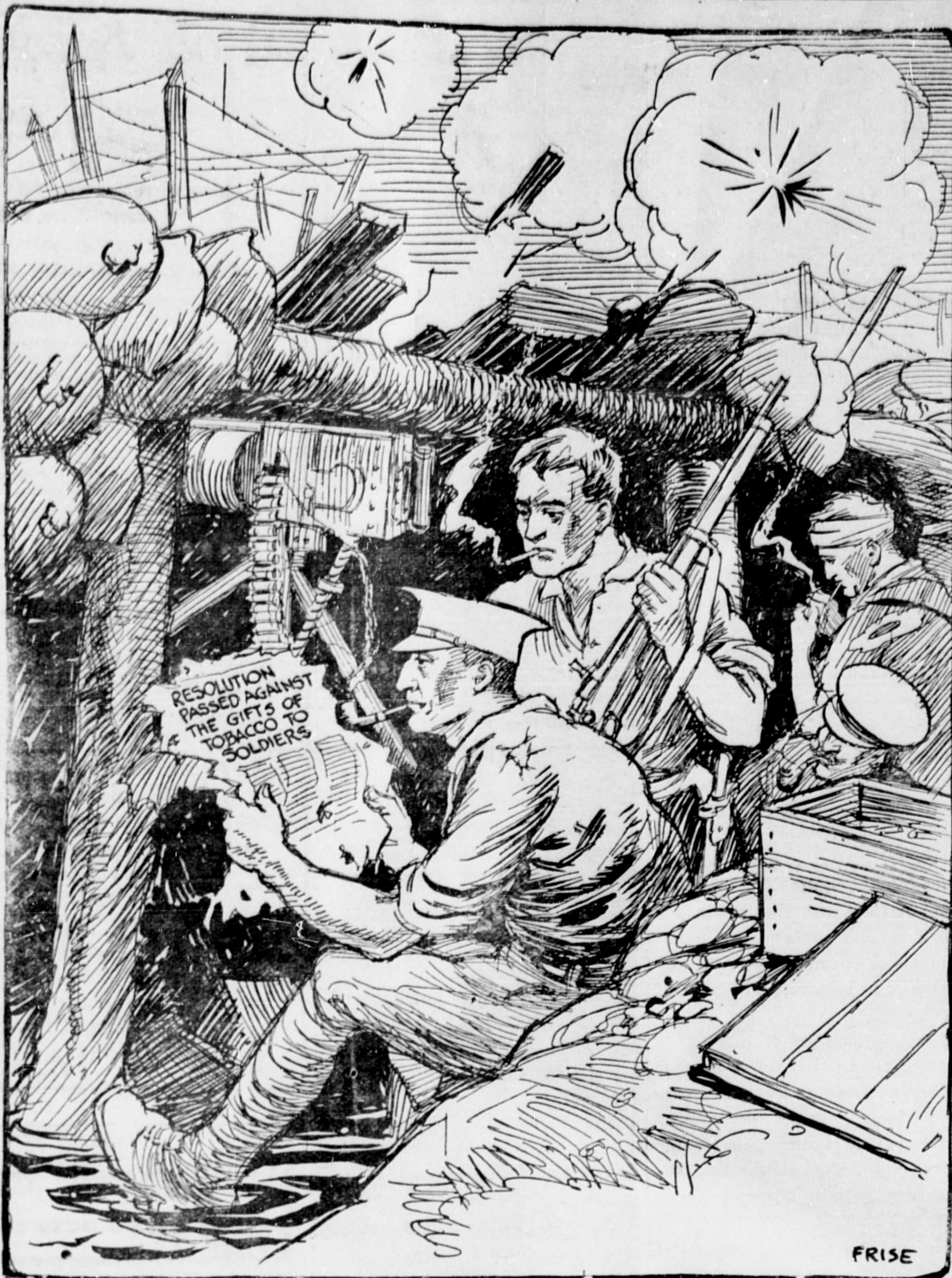
"WELL, CAN YOU BEAT THAT."

NOTE:—The Toronto Methodist Conference recently passed a resolution condemning the sending of tobacco to Canadian soldiers at the front.