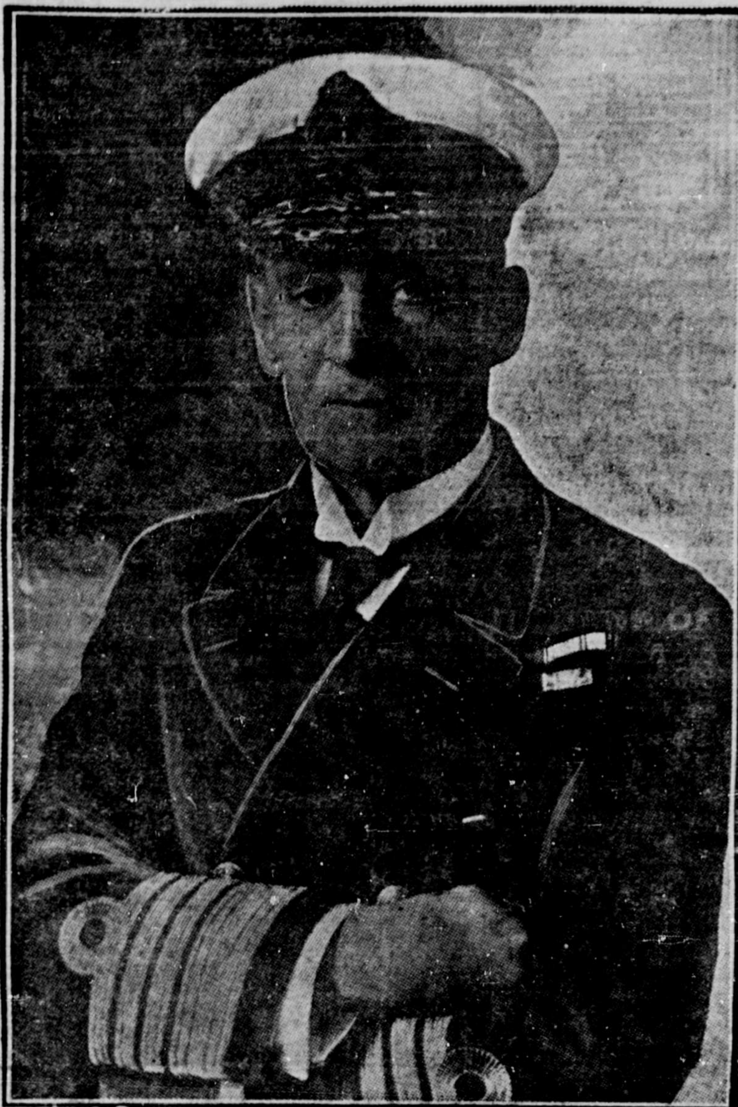
LORD FISHER'S SUCCESSOR, ADMIRAL SIR HENRY JACKSON