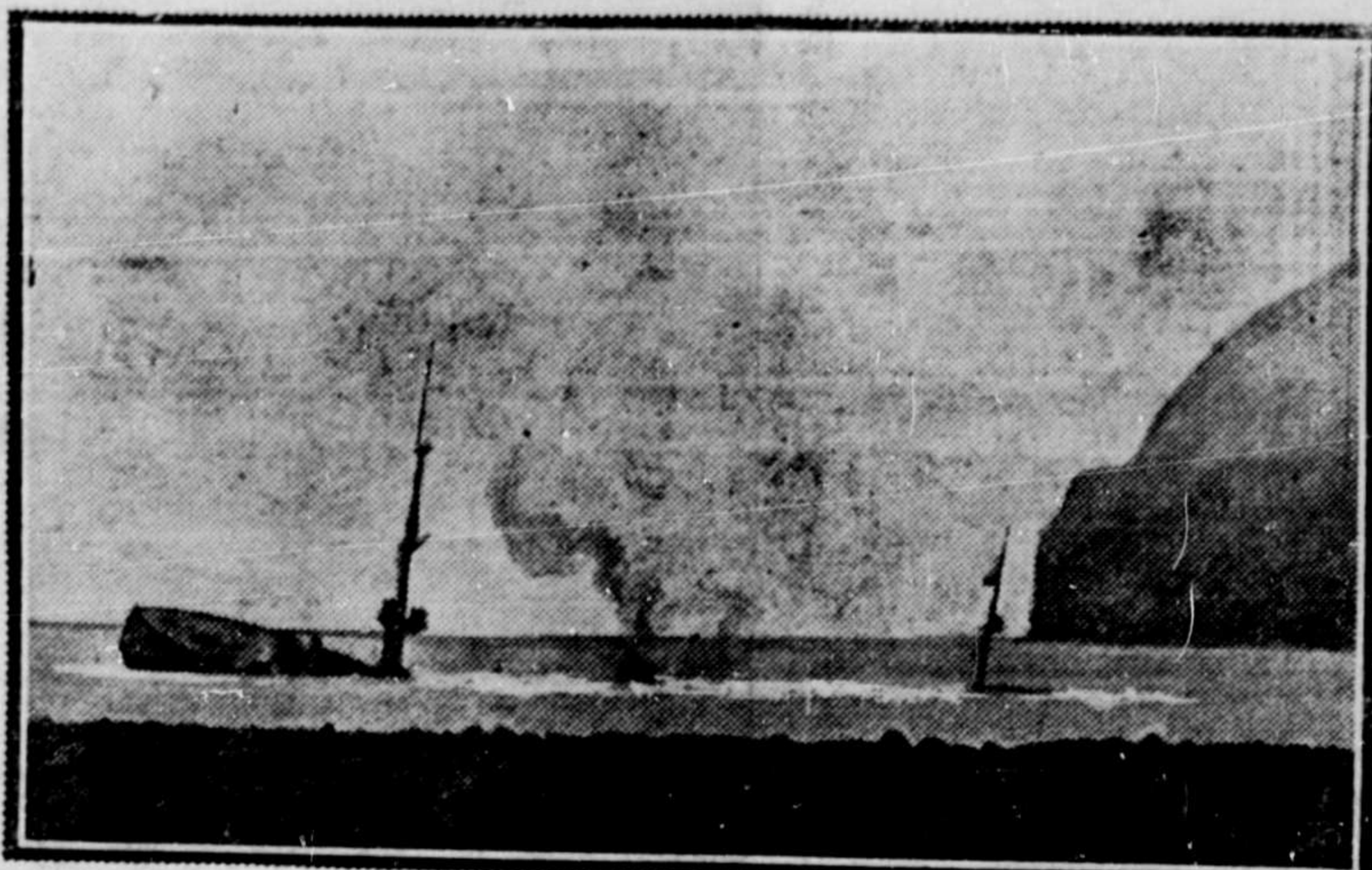
THE ILLFATED CRUISER DRESDEN AS SHE APPEARS TODAY—The island of Mas-a-tierra, one of the Juan Fernandez group off the Chilean coast is shown in the background.