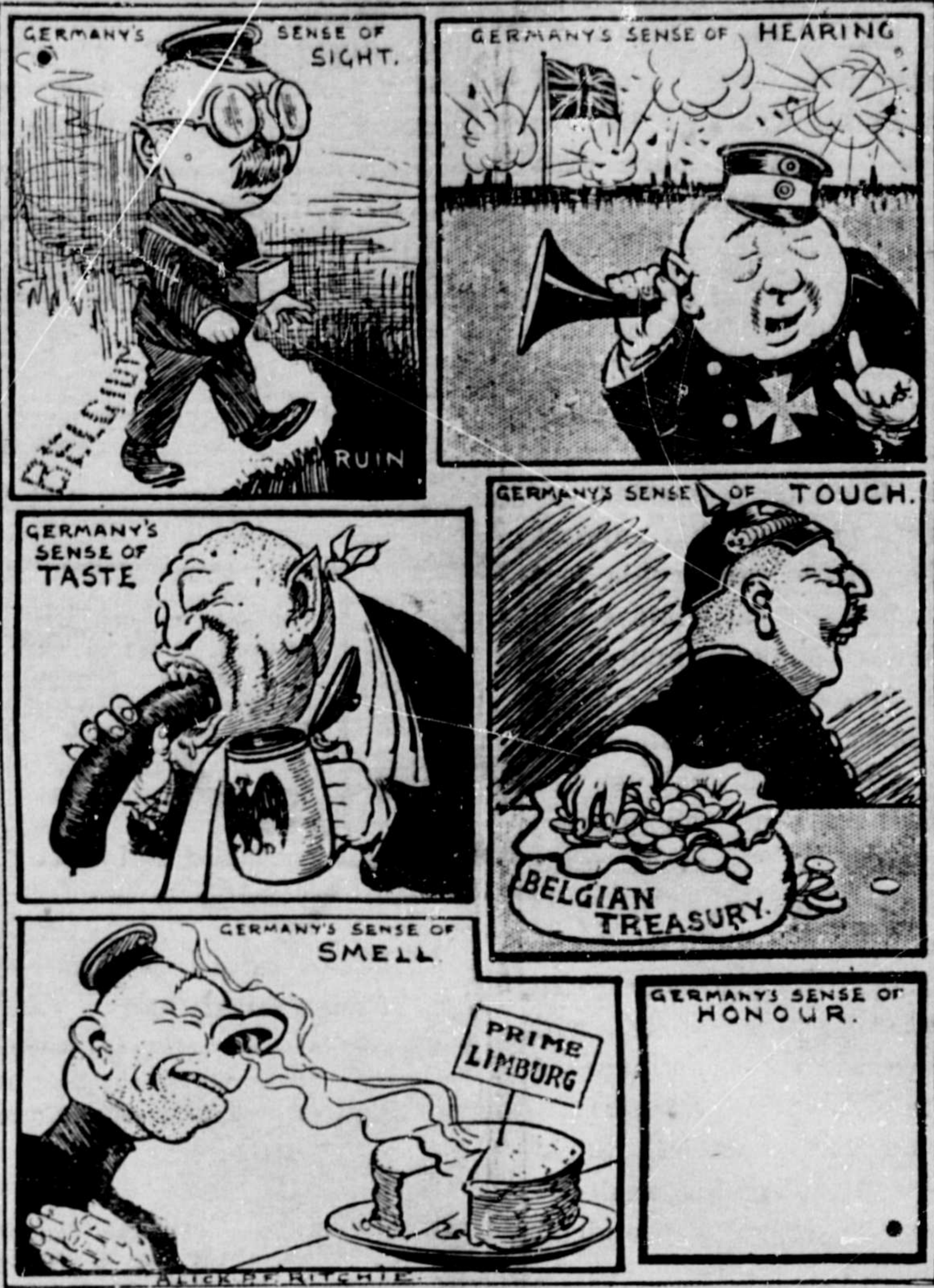
GERMANY'S SENSE AS REVEALED BY THE WAR

Bargains worth while in dry-goods and other lines—Wallace's Sale. 161-2