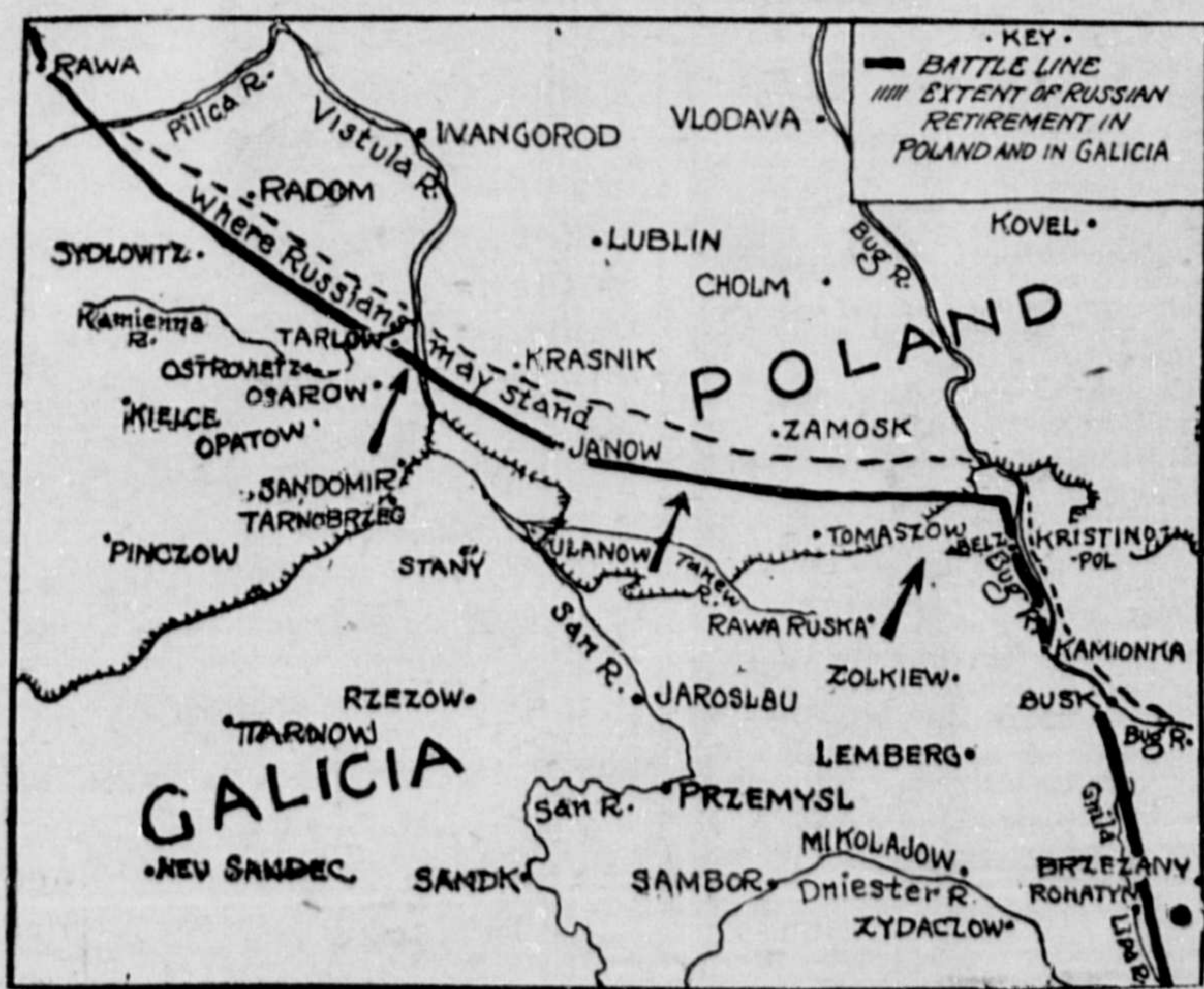
THE EASTERN BATTLE LINE

Bridgeport, July 17.—Experiments with a new Swiss engine in submarine G-3 for the United States navy have been a complete success. The engine drives both on the surface and submerged and extends the cruising area of a submarine to 6,000 miles.