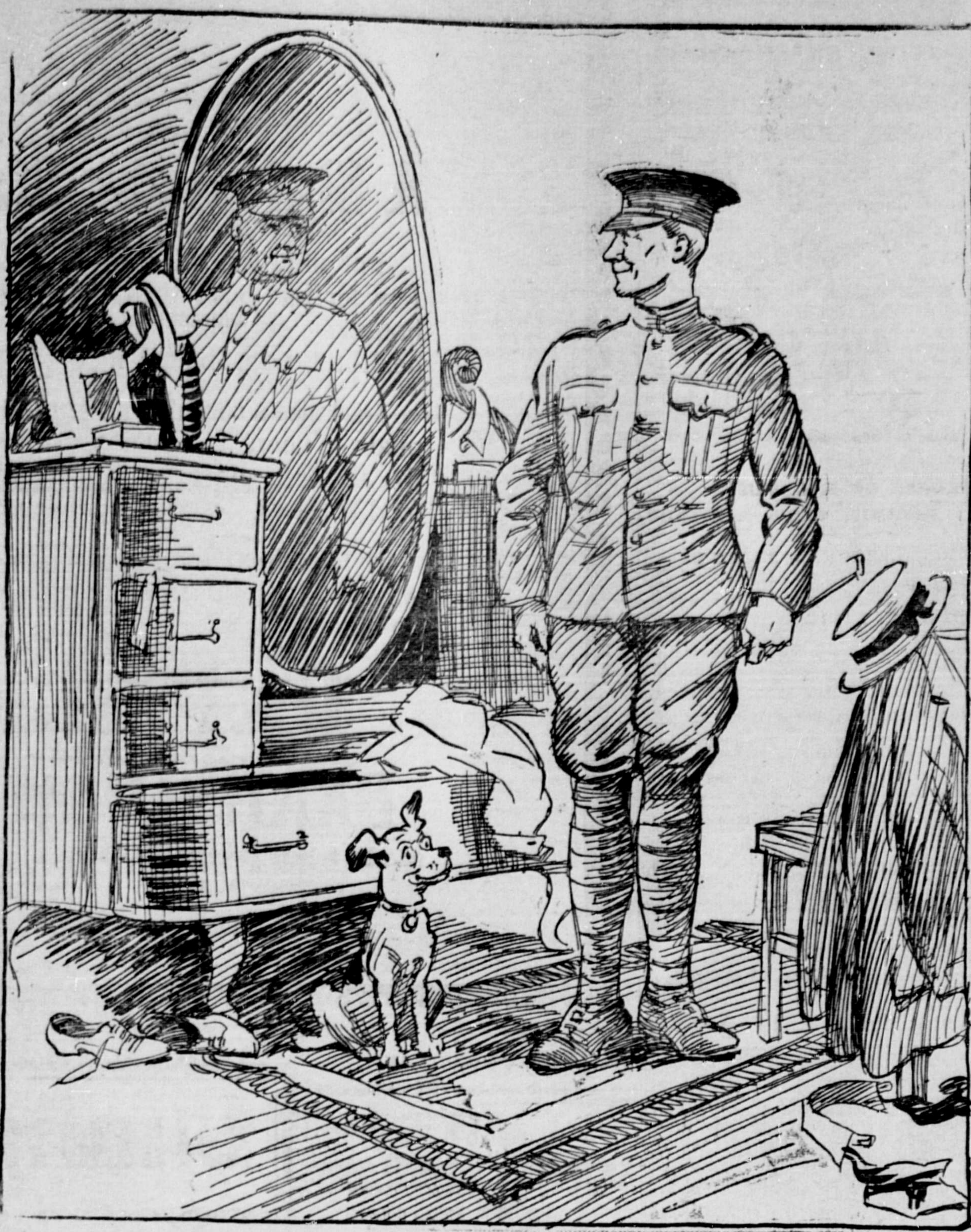
"THIS LOOKS BETTER"