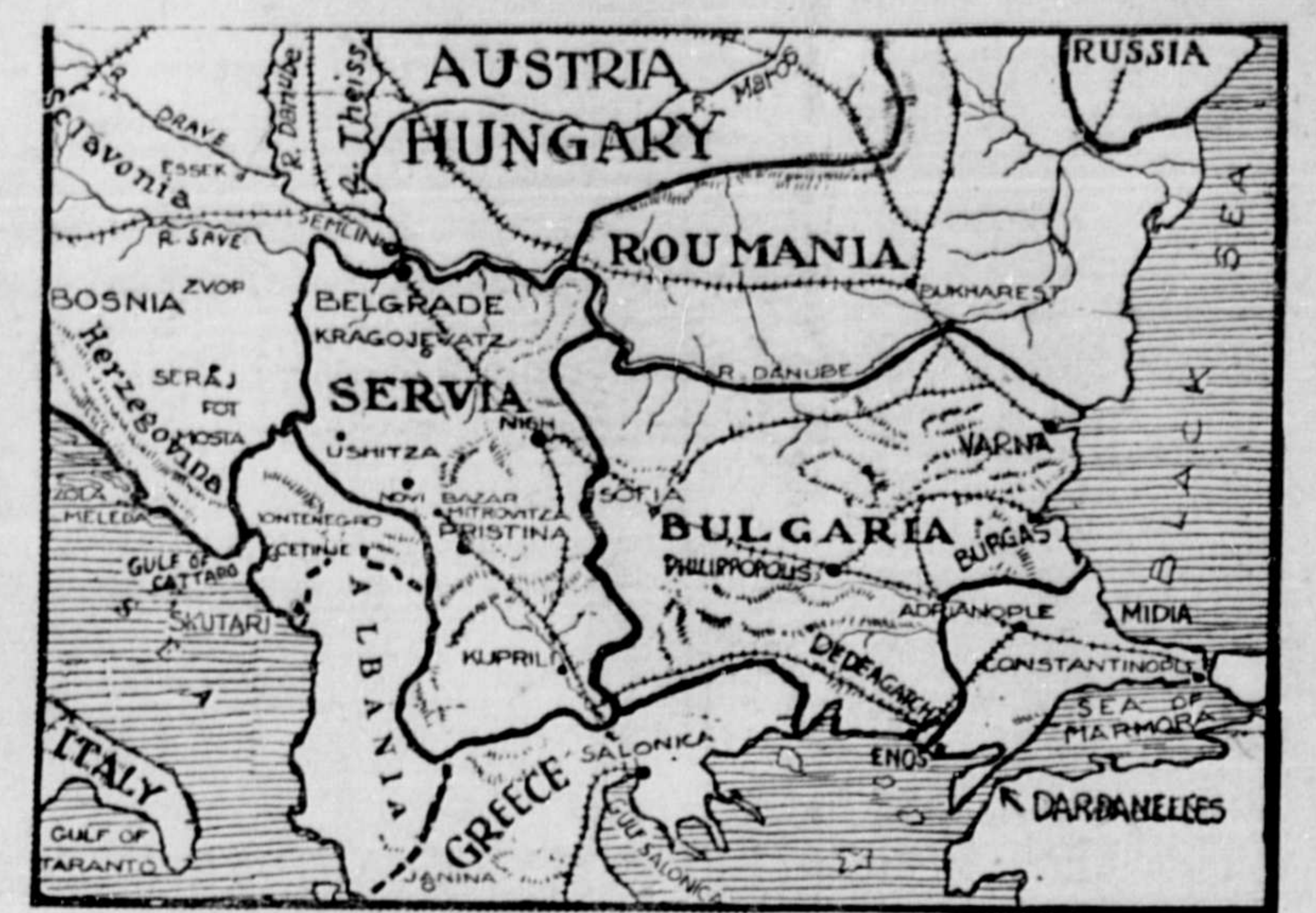
BALKANS ARE STILL COY