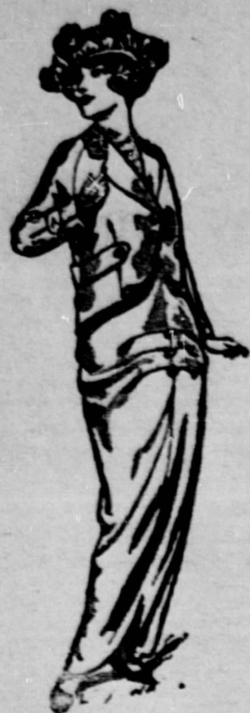
"NEMO," "AMERICAN LADY" and "PARISIAN" CORSETS

These are the three leading lines we carry and they are all so well known as to need no praise from us.