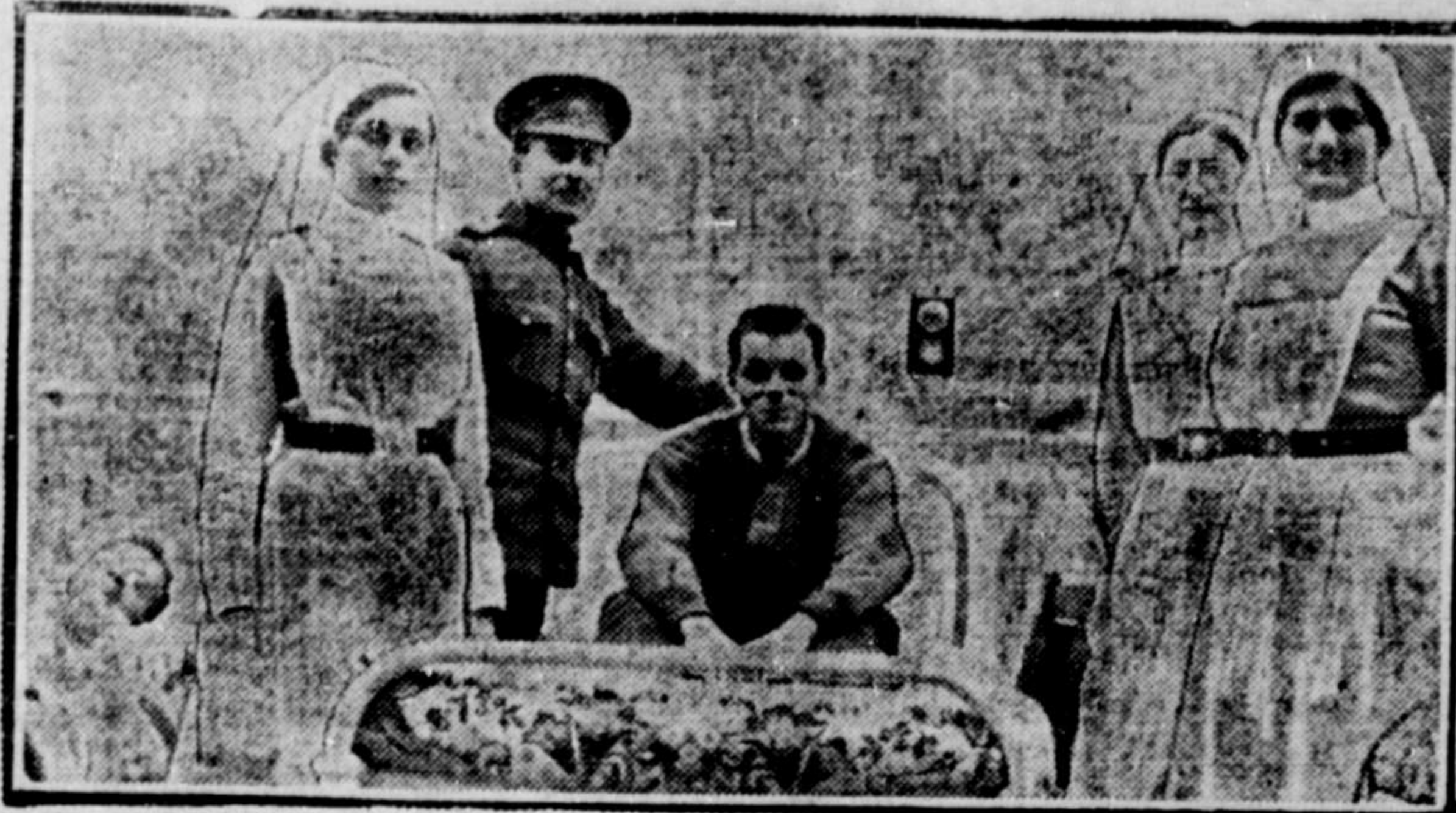
CANADIAN V. C. HERO IN HOSPITAL. CANADIAN NURSES

for war munitions. It is expected that Great Britain will collect and deposit American securities as collateral. Fighting 8,000 Feet Up. London, Aug. 14.—The Italians on the Isonzo are fighting at an altitude of 8,000 feet in very bit- ter weather. Austrian Submarine Sunk. Rome, August 14.—The Aus- trian submarine U-3 has been sunk in the Adriatic. Her crew of 12 were taken prisoners.