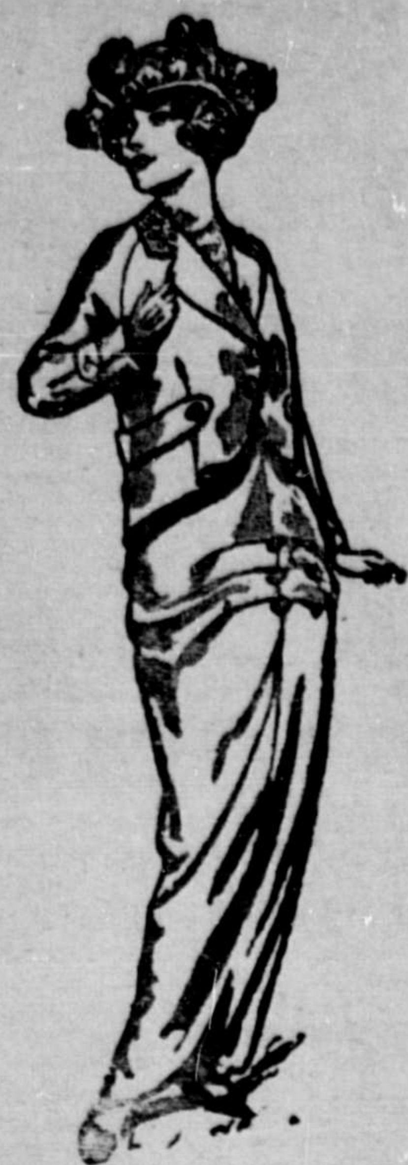
"NEMO," "AMERICAN LADY" and "PARISIAN" CORSETS These are the three leading lines we carry and they are all so well known as to need no praise from us.

Price from $1.00 to $6.75. H. S. WALLACE CO., LTD.