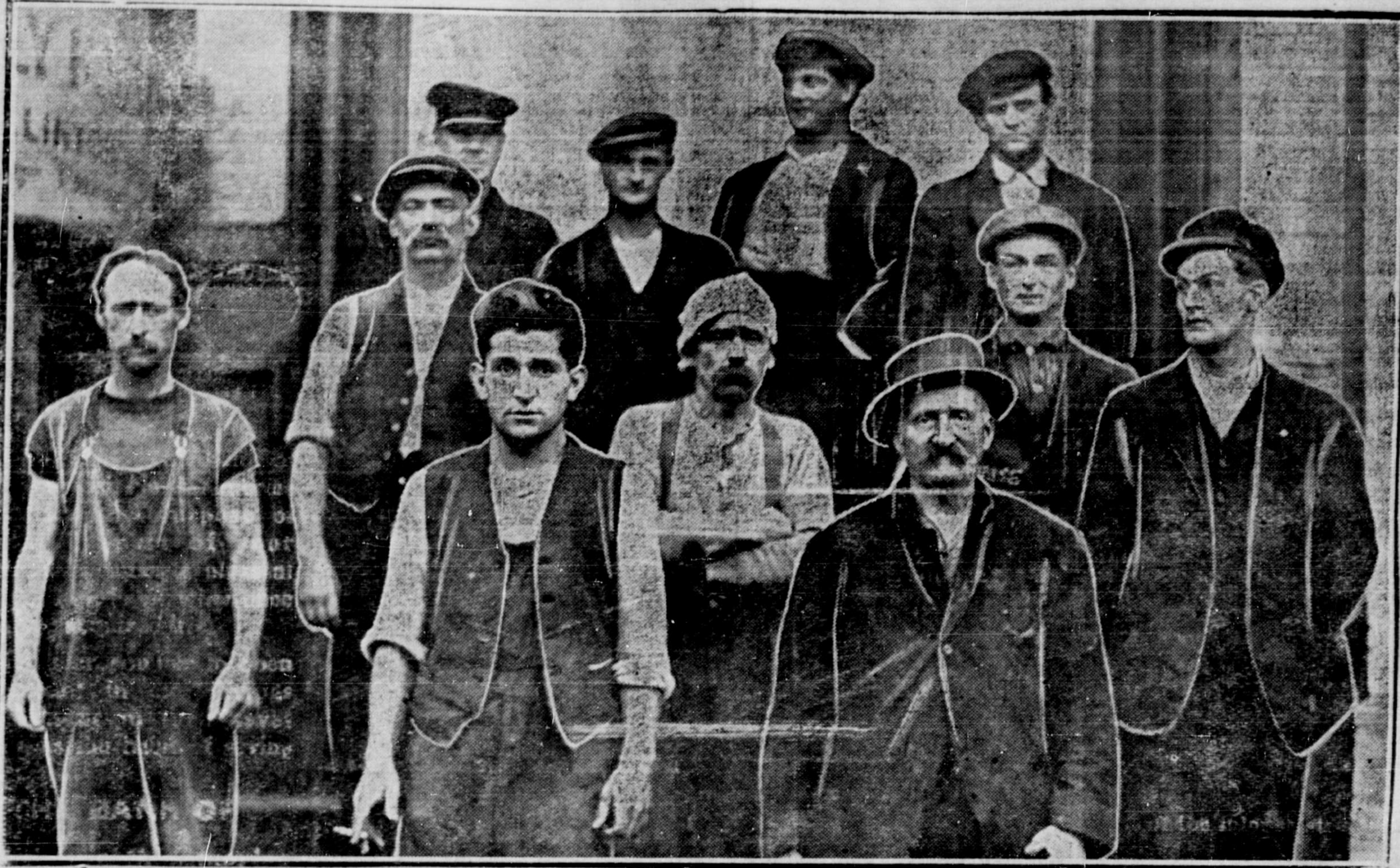
SAVED FROM LAKE ONTARIO WRECK WITH A LIFE LINE

In one of the worst storms in the history of Lake Ontario the Canadian Steamship Lines' freighter Alexandria, from Montreal to Fort William with package freight for Western Canada, was driven ashore on the famous Scargoro Bluffs, at Toronto's front door. For several hours, while the vessel was breaking to pieces in the storm, the sailors' lives were despaired of. Finally, through the bravery of farmers on shore, a life line was got to the steamer and in the darkness all were taken off. Above are eleven of the survivors, photographed a few hours after the accident.