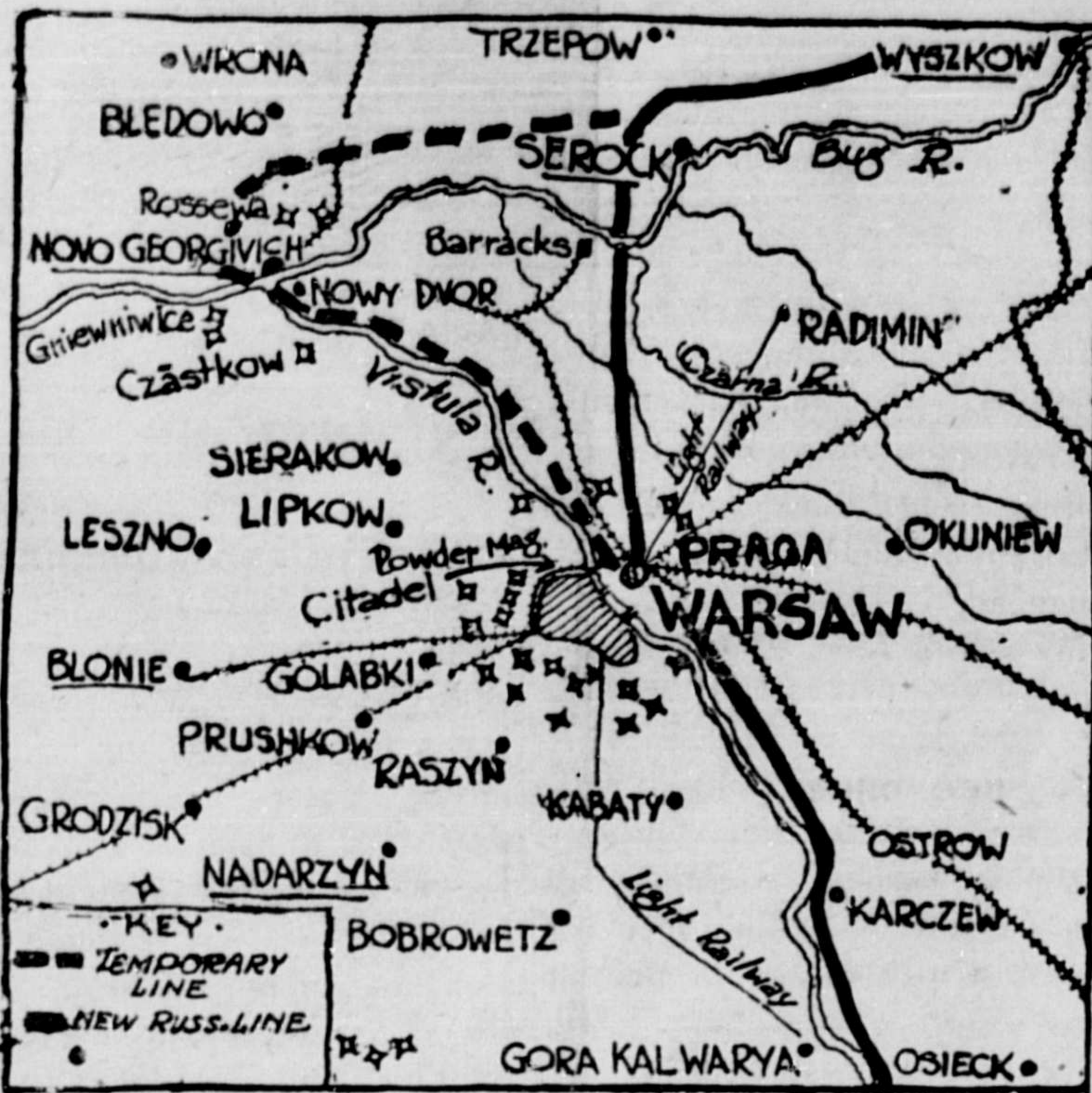
The map shows the location of the opposing armies since the fall of Warsaw. The dotted line is not now held by the Russians, except for a part around Novo Georgievsk. The forts extend ten miles out from the enciente.